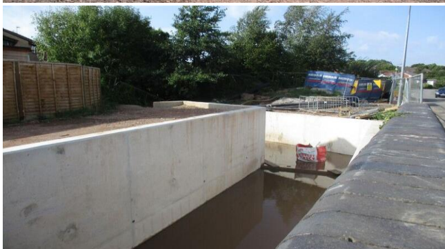
Images: (In order of display) Coldbrook Rd Outlet & Inlet Structures.