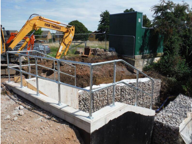
Image: Meadowvale Headwalls.

Both reinforced concrete headwalls are now complete. Waterproofing, backfill and Gabion baskets significantly completed. Meadowvale carriageway is now re-opened to the public.