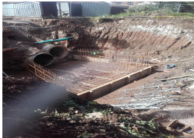
Image: Brookfield Avenue Culvert Crossing Works

Culvert Pipework Road Crossing works have been completed. Works will continue on the reinforced concrete outlet structure with backfill and Gabion basket wall to start at the Inlet Structure. The road closure to Brookfield Avenue is to remain in place at this time.