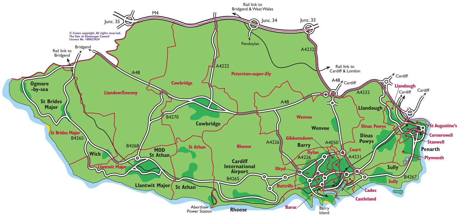
Vale of Glamorgan Ward Boundaries Ward boundaries are approximate only. Not to scale