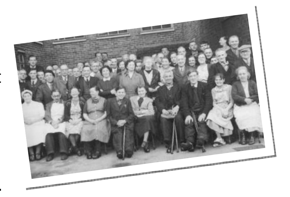
Remploy began making violins and furniture in a factory in Bridgend