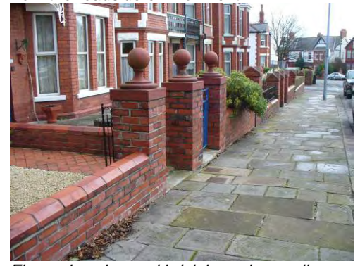
Flagged paving and brick boundary walls on Park Road.