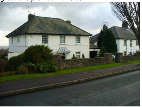
The architecture is typical of the garden suburb style.