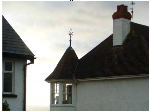
A viewing tower on a large house at Porth-y-Castell.