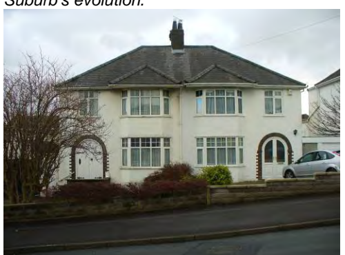
Houses built to the designs of the Great Western Railway in the 1920s