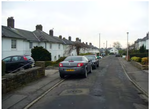
The dense development pattern creates a strong sense of enclosure at Tan-y-Fron.