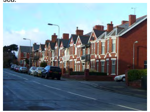
Red brick housing on Park Road.