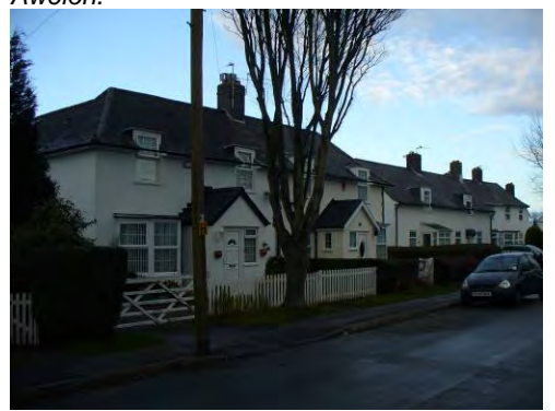
The first phase of building of the Garden Suburb on Westward Rise.