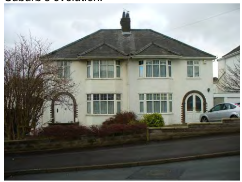
Houses built to the designs of the Great Western Railway in the 1920s