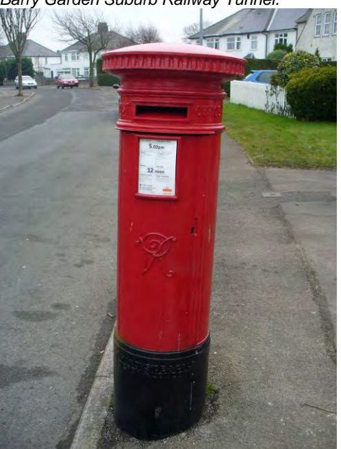
Royal Mail Post Box