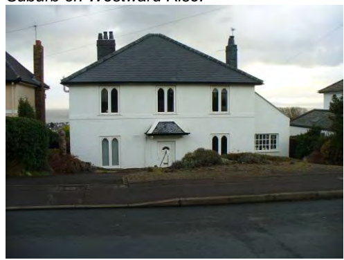
Larger houses near the end of the Garden Suburb's evolution.