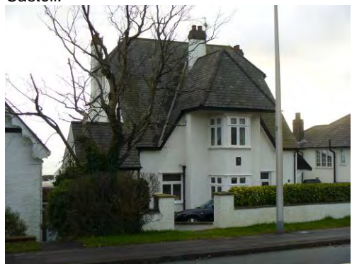
Unusual architect designed house at Porth-y-Castell.