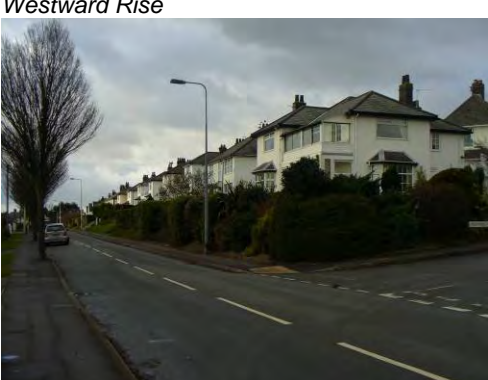
Houses make the best use of the sloping ground to provide views out.