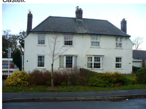
Local adaptation of the classic suburban semi-detached house.