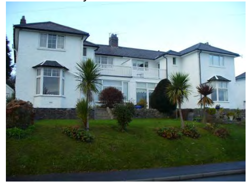
Houses on the north side of Porth-y-Castell with balconies to exploit the views.