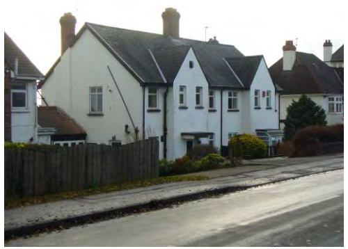
Houses stand below the road level to the south of Porth-y-Castell.