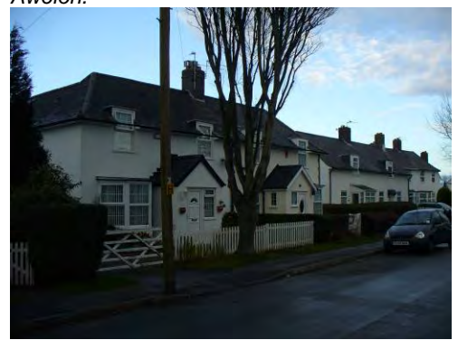
The first phase of building of the Garden Suburb on Westward Rise.