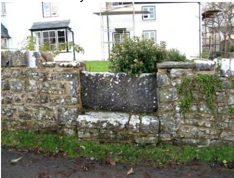
Stone stile outside Y Hen Fferm Dy.