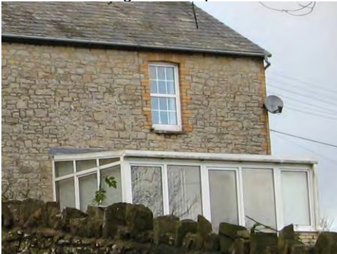
uPVC windows, prominent conservatories and satellite dishes can detract from the special character of otherwise positive buildings.