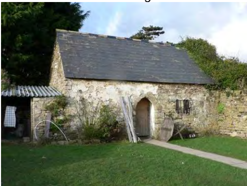
Detached Kitchen at Flemingston Court.