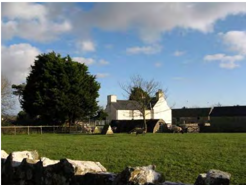
View to Flemingston Court Farm from the north.