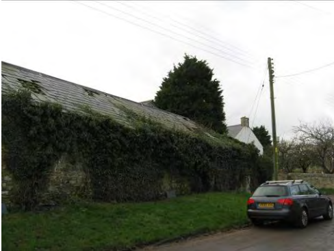
These outbuildings are in a poor condition.