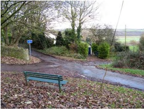
The rural lane in the southern part of the Conservation Area.