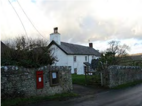
Y Hen Fferm Dy.