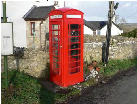
Telephone Call Box.