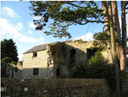
The House ruins at Flemingston Court.