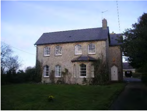
The Old Rectory.