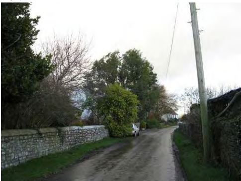
The lane in the middle of the village.