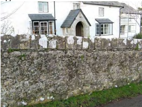
Stone walls outside Y Hen Fferm Dy.