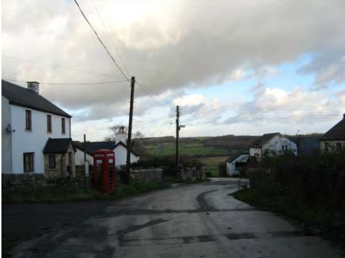
Due to its elevated position, the hamlet enjoys views over the valley.