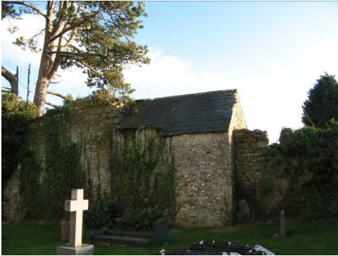
Ivy can cause significant damage to historic buildings.