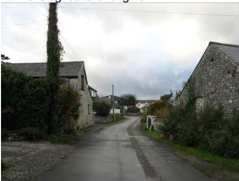
The hamlet developed around historic farms.