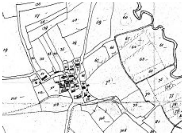
Extract from Tythe Map