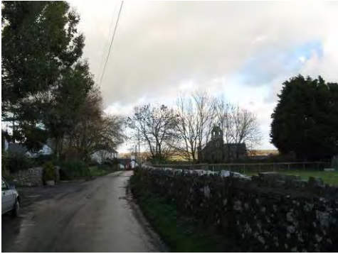
View towards St Michael's Church from the south west.