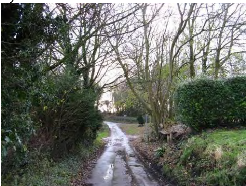
Woodland setting to south of the village.