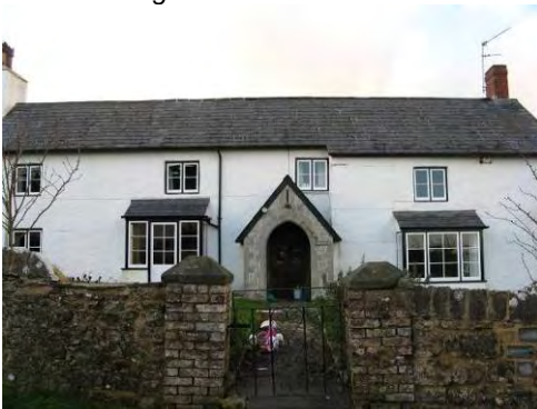
Y Hen Fferm Dy.