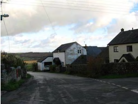
Church Barn provides historic links to the hamlet's agricultural origins.

The Conservation Area's principal historic buildings are St. Michael's Church, Flemingston Court Farm, its adjoining range of barns, and Y Hen Fferm Dy, all of which are listed. The adjoining (unlisted) group of agricultural buildings to the north of Flemingston Court is also of note and although converted, provide an interesting ensemble of stone and slated mainly single storey buildings. Across the lane to the north of these buildings, are two further historic buildings, one of which (Valley House) was also in part once a barn. Rose Cottage is unlisted but is a typical thatched 17 th century cottage. Next door, Glebe Farm appears to have been substantially rebuilt. The Old Rectory, set back and almost hidden from the village centre, is a modestly sized house built between 1840 and 1877. Otherwise, there are two pairs of late 19 th century workers' houses (nos. 1- 4 New Cottages) on the southern edge of the village. Apart from the converted barns around White Farm House, and the farmhouse itself (which has been extensively altered), all of the other buildings in the Conservation Area date to the later half of the 20 th century and consist of bungalows or two storey detached houses of varying sizes.