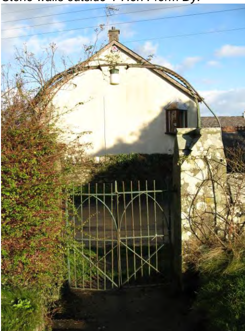
Interesting gates at the entrance to the churchyard.