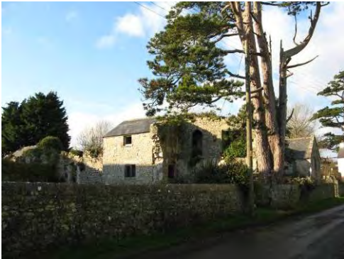
Flemingston Castle with St. Michael's Church beyond.

Of special note is the hillside location with the Conservation Area being located just above the point where the hill dips steeply down a slope towards the river Thaw. This provides dramatic views from many vantage points within the north eastern edge of the Conservation Area.