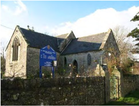
St. Michaels Church.