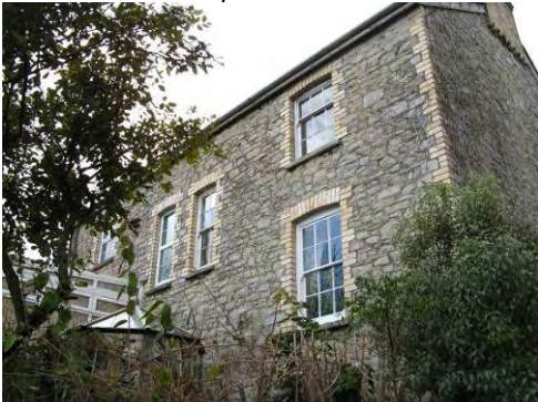
Unlisted 19 th century cottages on edge of the village (New Cottages)