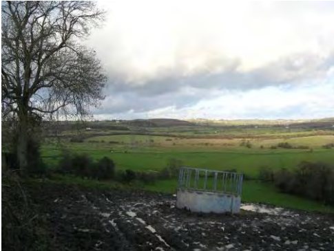
View to the north from outside Y Hen Fferm Dy.

The overall character of the village is mostly defined by the important group of historic buildings around Flemingston Court, with an impressive range of listed barns, and the Court itself. Its relationship with St Michael's Church, which lies immediately next to it, confirms the ancient origins of the settlement. The other former barns, which lie to the north east of the road facing the Court, have all been converted into houses. However, they still form a tight group of interesting structures, along with some workers' cottages of Victorian age.