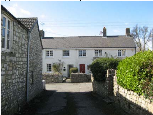
Stone walls and hedges typically bound front gardens.