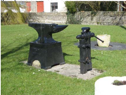
Anvil on the village green close to the former village smithy.