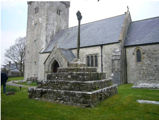
Cross in Churchyard.

A stone Calvary or churchyard cross base, probably 15 th century. A modern cross is set in the original socket stone.