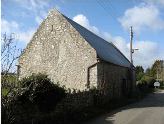
Barn at Great House Farm.