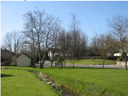
The stream running through the village green.