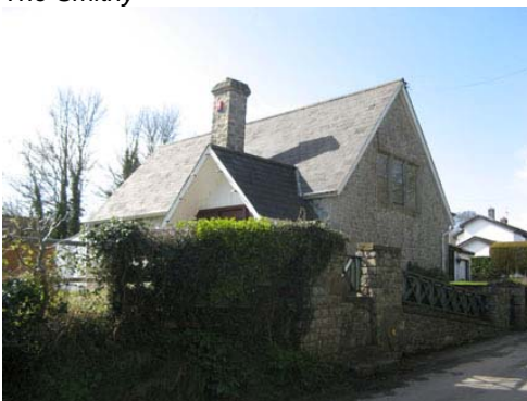
The Village Hall, formerly the school.