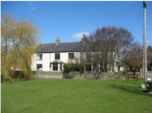
Historic buildings overlooking the green