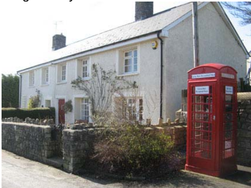
The general condition of the conservation area is good.