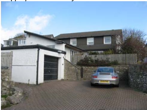
Modern infill housing.