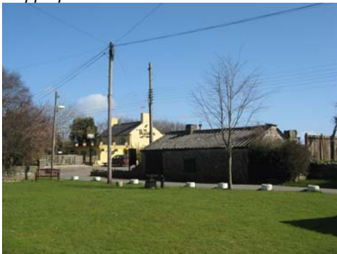
Overhead wires detract from the street scene.