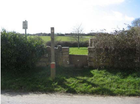
The village lies on the Valeways Millennium Heritage Trail.

Leading west from the church is a narrow lane whose historic origin is attested by its varying width and alignment. Historic properties on its south side compete for attention with modern houses on the north side.