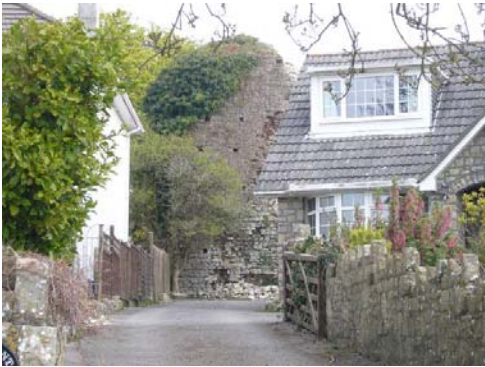
Malifant Castle Walls.