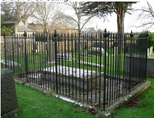
Railed Tomb to Nicholl Family.

The church dates from the 13 th century with the tower added in 1632. It was much altered in the 19 th century. The church is notable for its Norman font, 15 th century upper parts of the chancel screen and a medieval wall painting, possibly of St. George.