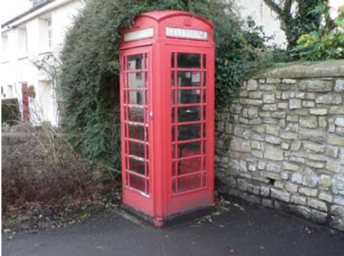
Telephone Call Box.

A 17 th century barn, altered probably in the 19 th century, built of local white limestone with a steel sheeting roof. The wall to the road has a central elliptical arch to the threshing floor with a plank door, the head would appear to be a 19 th century rebuilding with an increased width of door.