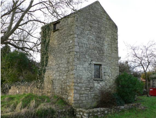
Dovecote at Llanmaes House.