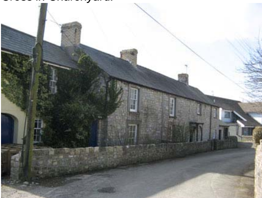
Plaisted House and Plaisted Cottage

Possibly the later parlour was built on as a separate dwelling; the property was owned by the Plaisted family in the 18 th and 19 th cent., and until recently the later parlour was used separately as the dower house.