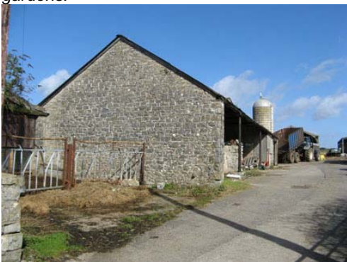
Local lias limestone is the prevalent building material, especially of farm buildings.