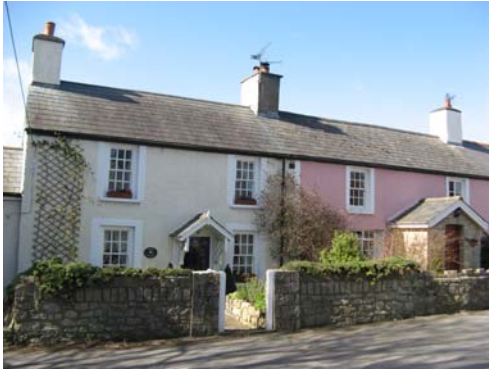
Colour washed roughcast render.