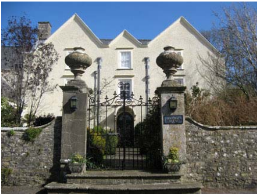
Walls, Gate Piers and Gates to Llanmaes House.