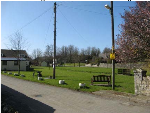
The village green has a sunny aspect but its appearance is marred by overhead wires