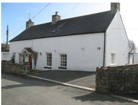
West Farmhouse and Barn.

Seventeenth century farm and barn on the outskirts of the village.