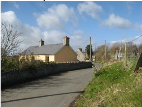
At the edges of the village, development is more dispersed.