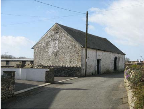
Vernacular farm building constructed of local stone with Welsh slate roof.

A dovecote that is probably contemporary with the main development period of the house, 1685-1710, but it could be older as it is noticeable that the wall to the formal garden abuts it. Built of local limestone random rubble with a Welsh slate roof, this rectangular structure has a gable roof and may have been a gazebo before it was a dovecote. The west wall has a perching ledge and an arched opening to the columbarium in the gable.