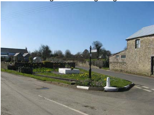
An old pump stands in a small triangle of land in the north of the conservation area.

The conservation area is primarily residential. Former agricultural activities such as the smithy have ceased within the area although there are some remaining working farm buildings. A former pub, The Brown Lion, and post office have closed but the Blacksmith's Arms PH remains. The 19 th century school now serves as the village hall and several former farm buildings have been converted to residential use. St. Cattwg's Church is an active place of worship.