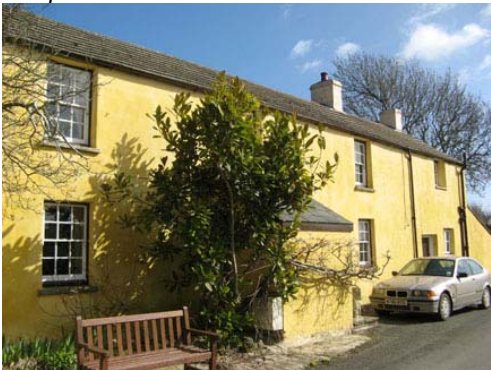
Brown Lion Cottage.

Two storey former public house of the 18 th century also used as a court house and Methodist meeting house.