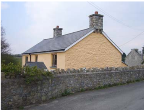
Mill House Cottage.