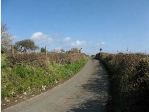
The southern approach to the village is via a narrow country lane.