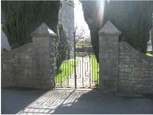
Small items such as these gates and stone gate piers enhance the conservation area.