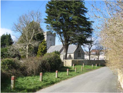
Wooden bollards prevent vehicles eroding the grass verge beside the church.