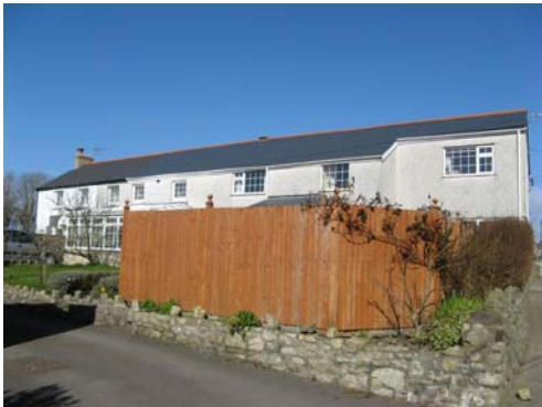
Inappropriate boundary treatments.