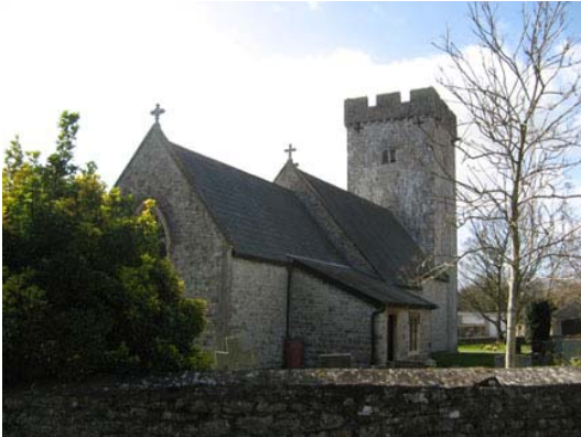
Church of St. Cattwg.