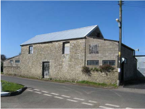
Farm buildings are a feature of the village.