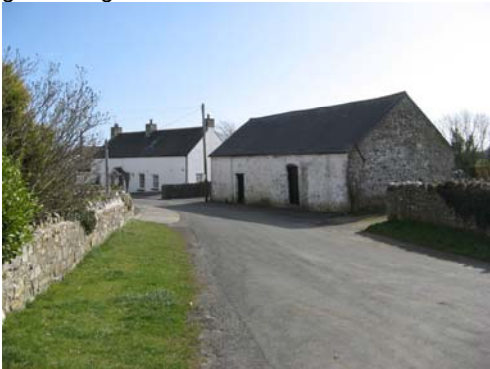
Dwellings, former agricultural buildings and stone walls combine to define the street scene.