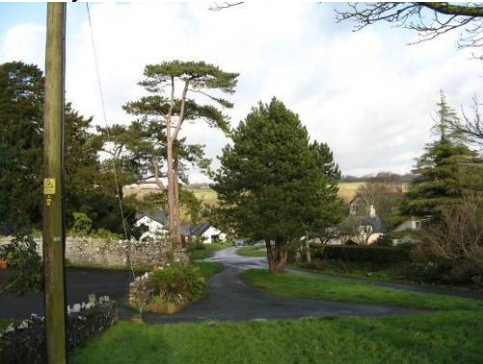
View northwards towards the centre of the village