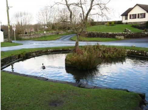
The pond in the centre of the village is an important feature.