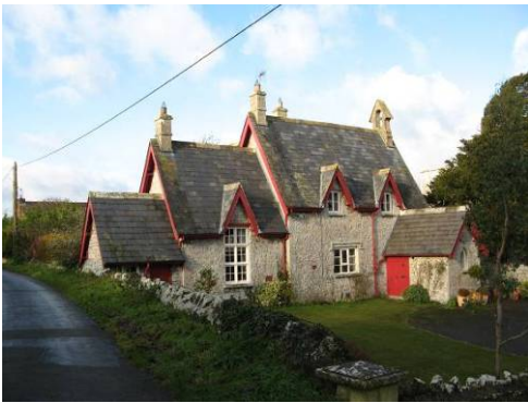
Former Village School.

An imposing mid 16 th century farmhouse originally with central hall and two outer rooms. refaced in the 18 th century and extended to the rear by a two storey wing with sash windows and a panelled front door with original fanlight over. Some of the windows have stone quins and keystones for the lintels. Thick slates cover the roof.