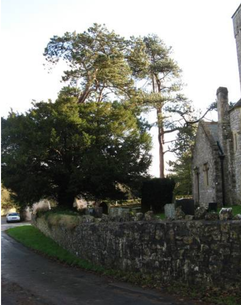
Trees and limestone walls are important in the conservation area