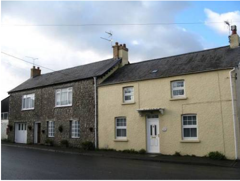
These unlisted buildings need to be protected from unsympathetic alterations