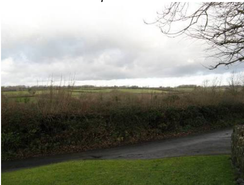
View northwards from outside Madison