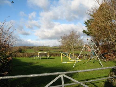
View north from Squire Street

There are six listed buildings or structures – the church, the adjoining village school (now a house), the former Ebenezer Particular Baptist Chapel, and Llysworney House, formerly the Great House and the largest and most prestigious house in the village. Additionally, the sheep washery and a milestone outside