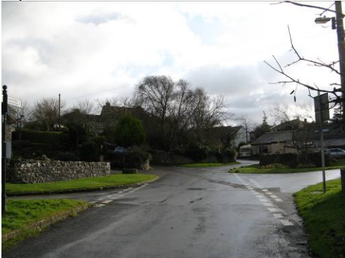
Trees and stone walls are important elements in defining the character of the Conservation Area.