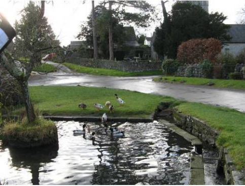
The village pond has biodiversity as well as amenity value

The area around the village pond, overlooked by St. Tydfil's Church, is well cared for.