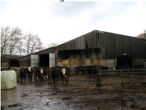
Moat Farm is still a working farm.