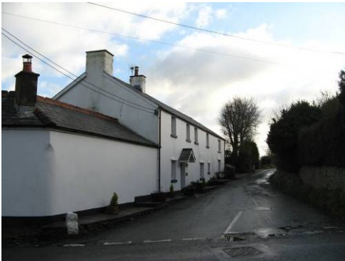
The Corner House

A small house of early C18 date with simple roughcast facades, fenestration with traditional casement windows. The building has a lobby entry plan, with a small bake house added at the entry end.