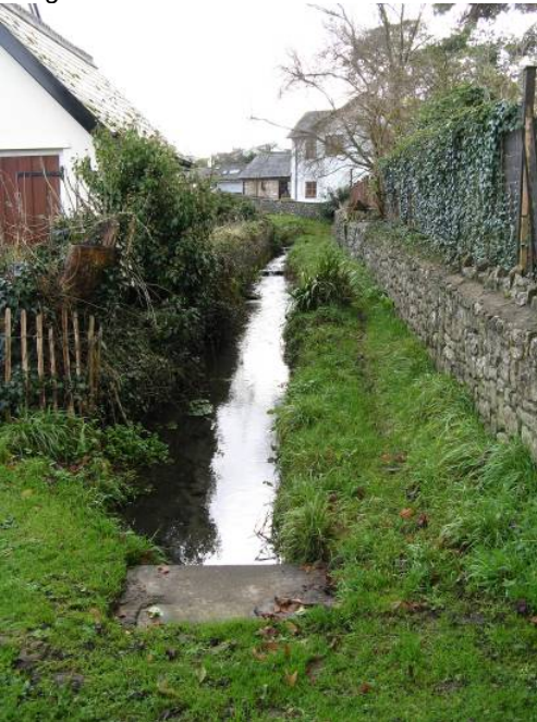
A small stream flows through the village