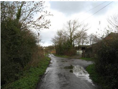
A rural lane leads north past Moat Farm