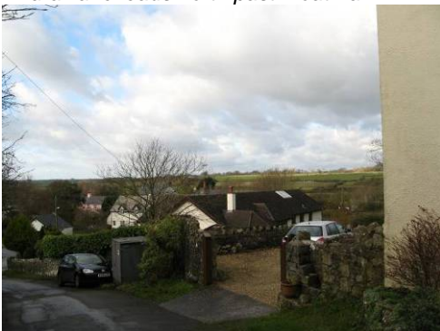
View over the village to the hillside setting to the north