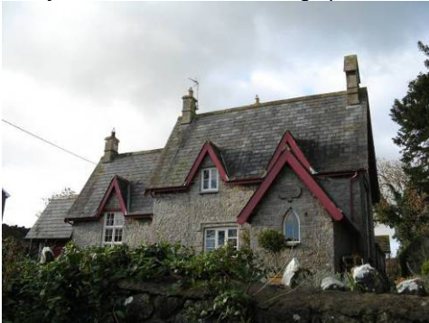
The former village school.