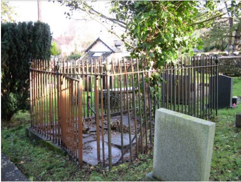
Local details such as these iron railings in the Church yard add to local distinctiveness.