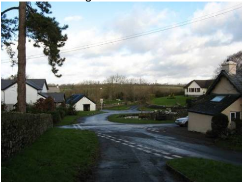
View over the village centre.