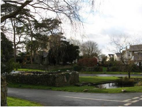
St. Tydfil's Church and the village pond.