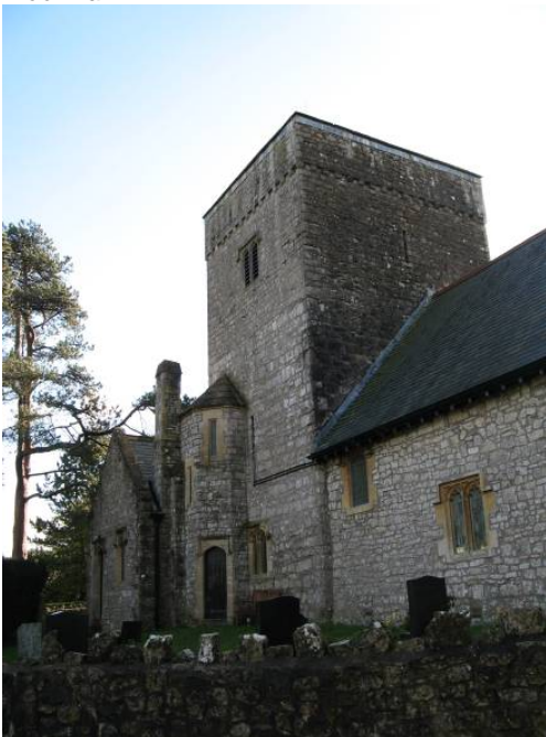
St. Tydfil's Church