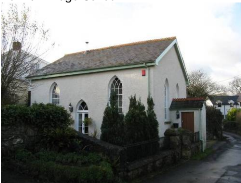
Former Ebenezer Particular Baptist Chapel.

Whilst this building has been converted into a small house, it retains many features of its original design including its Gothic pointed windows, with arched glazing bars. The roof is covered with natural slate with red clay ridge tiles.