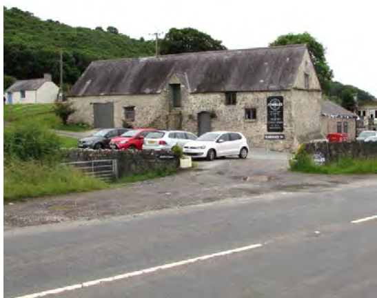
Photographs: Successful conversion of rural buildings at Ty Maen Farm Buildings, Ogmores-By-Sea

5.7 Additionally, the Council will not normally grant consent for conversion in respect of more recently constructed or reconstructed rural buildings including agricultural buildings which have been constructed through "permitted development" rights available to agricultural uses 11 .