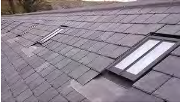
Photograph: 'Conservation Style' roof lights in natural slate roof

9.5.2 The roof is generally the least likely element of a rural building to remain totally intact due to dereliction or vandalism. Where re-roofing is required, natural slate should always be used where new roofing is necessary, or where other traditional materials have been used, e.g. Roman clay tiles, these should be replicated. Ridge tiles should be plain clay not concrete. In some circumstances other modern materials such as standing seam metal roof or corrugated sheets commonly used in utilitarian agricultural buildings, may be appropriate where they help to retain the rural character of the building.