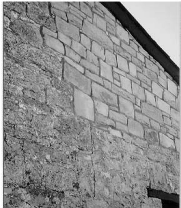
These pictures illustrate a contrast between weathered stonework with 'flush' pointing and badly restored stonework with harsh 'recessed' pointing.

"Strap" and "recessed" pointing is not suitable as this will provide undue emphasis on the coursing of the stonework.