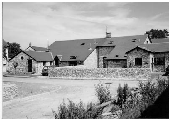
The open courtyard has been subdivided by artificial roads and boundary treatments to the detriment of the setting of the converted rural buildings.

iii) The agricultural character of the building's setting should be retained by the use of traditional stone paving or stable block setts and simple landscaping. With residential conversions, the unavoidable domestication of the setting of the building involving car parking, paths, garden areas and minor domestic artefacts, such as clothes lines and television aerials can have an unacceptable impact on the landscape. External clutter relating to conversion for business use will also be taken into account.