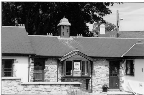
A poor combination of render and stonework combined with the bay window and the 'fleur-de-lys' ridge tiles gives this dwelling an inappropriate suburban feel.

ventilators, moulded or chamfered timbers, flagged flooring old mullioned windows and date stones. On more formal buildings the interesting features might be symmetry in the layout of buildings or the arrangement of openings, semicircular arches, decorative brickwork, dressed stone and ornamental slate roofing.