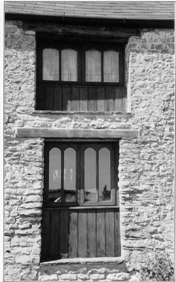
The original openings have been retained with the use of tailor-made timber window frames and panelling which blend well with the building's overall appearance.