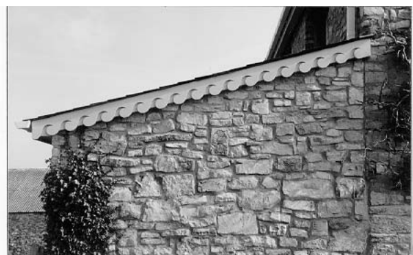
Verge detail should always be kept discreet and simple. Modern painted bargeboards do not reflect the original character of the building.

iii) Verges and eaves details are often overlooked when converting a rural building. Verges often comprise simple slate on stonework with a maximum 40-50 millimetre overhang. Modern bargeboards / soffit details with overhangs are not appropriate. Careful consideration should be given to an appropriate eaves detail which replicates the original character of the building.