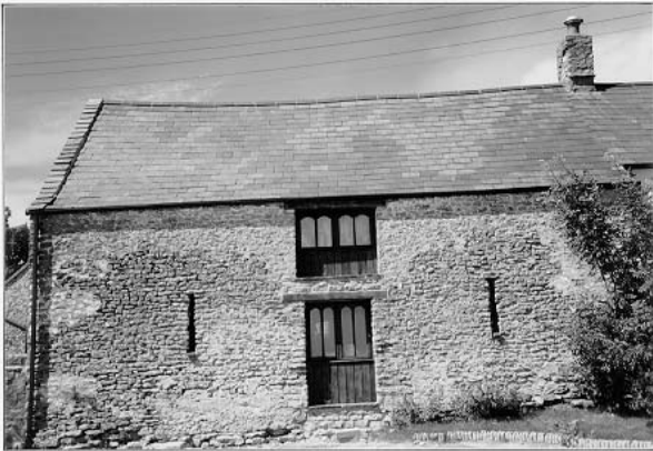
A good example of a barn conversion carried out with minimal alteration to the building's external fabric. Simple wall and roof treatments have retained its original character and appearance.

remain intact along with the openings to which they lead. These openings can often be used for new windows with timber panelling beneath if a door entrance is not required.