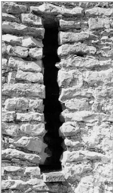
Subtle internal glazing has reserved the original form and appearance of this slit ventilator.