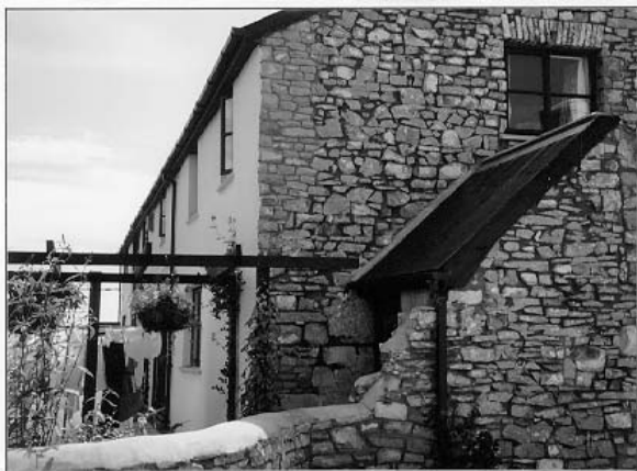
The domestic clutter shown in these pictures detracts from the simple opening of a rural building. Lamp standards, pergolas and obvious clothes drying areas, for example should be avoided.

within the curtilage of the building should be retained and protected. Where planting / screening is proposed, this should comprise indigenous species. Conifers in particular should be avoided as an alien and incongruous feature in the rural landscape.