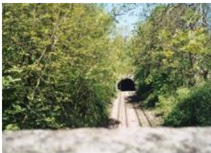
Garden Suburb Railway Tunnel, Barry