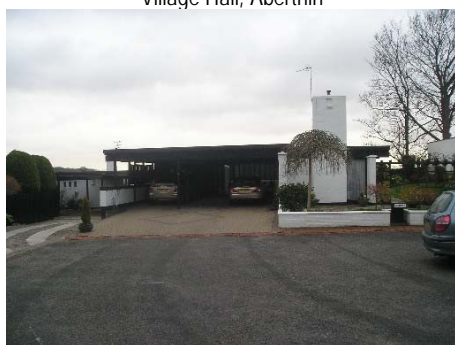
Modern housing at The Mount, Dinas Powys

3.1 The locally identified features/buildings were identified by means of a partnership between the Council, representatives of town/community councils, the Penarth Society, other local amenity societies and independent local volunteers. Led by a steering group appointed in 2002, the project was partly funded by the Heritage Lottery Fund which provided support for a project co-ordinator.