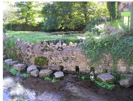
Baptismal Pool, Ewenny