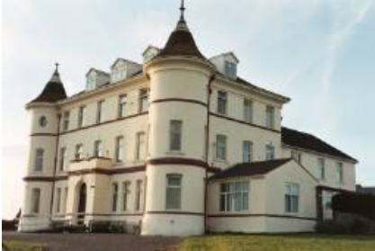
Southerndown Care Home