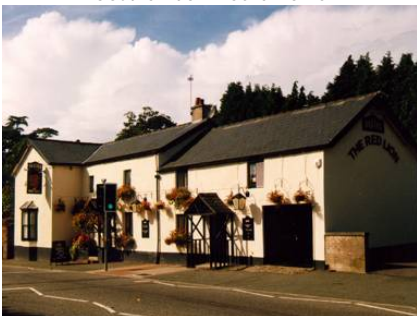
The Red Lion, Bonvilston