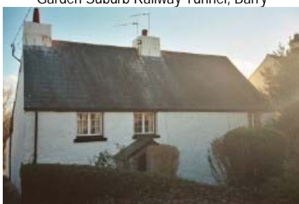
The Ramblers, Colwinston