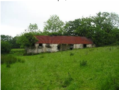
Tyr Mynydd, Welsh St. Donats

9.1 County Treasures is now available on the Council's website and includes the name and community of each building along with an architectural description, its reason for inclusion, a photograph and map.