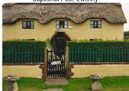
The Manse, Llanbethery