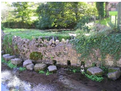
Baptismal Pool, Ewenny