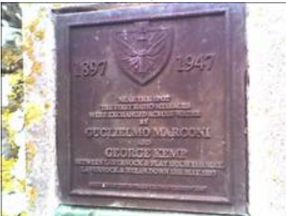
Marconi Plaque, Lavernock