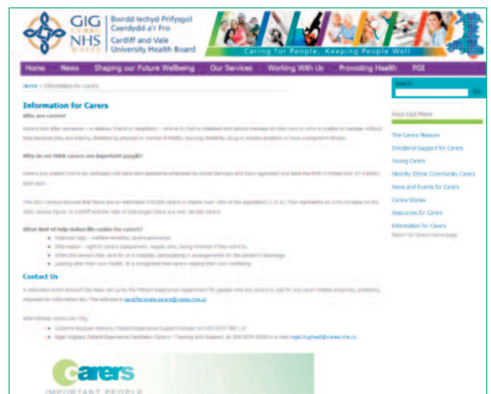
Cardiff and Vale UHB Internet Site – Carers Page