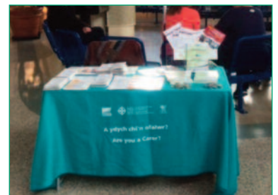
Stand Concourse UHW