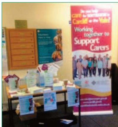
Carers Rights Day 2014 Barry

During the events 86 people were seen; including carers and staff.