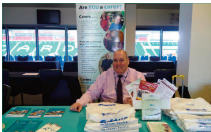
MEC Fair Cardiff City Stadium 2015