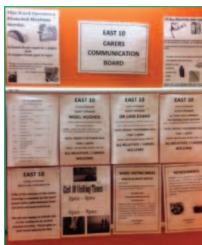
Mental Health Training Board