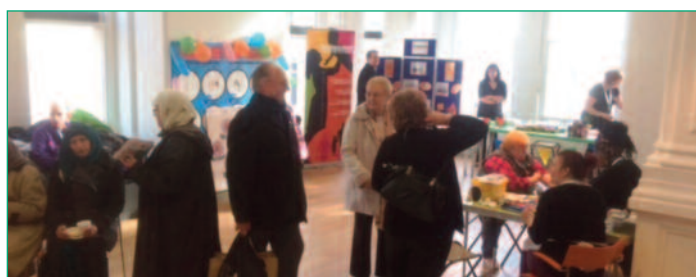
Co-creating Healthy Change 2015