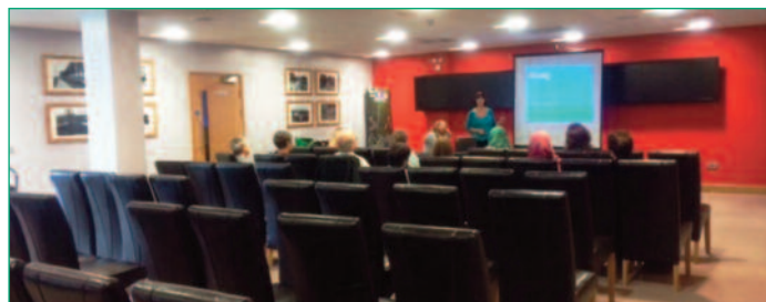
Carers Week 2014 Cardiff City Stadium

A total of 35 people, participated in this health screening.