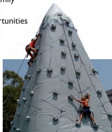
Climbing wall challenge