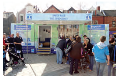
TREV in action - Safer Vale Display Vehicle