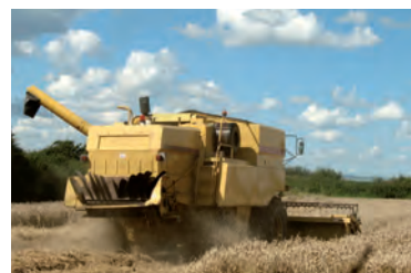
Harvesting the crop, Wick