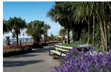
Italian Gardens, Penarth