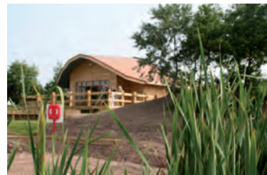
Tranquillity at Cadoxton Lakes