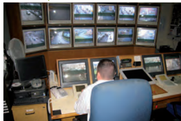
CCTV in Barry