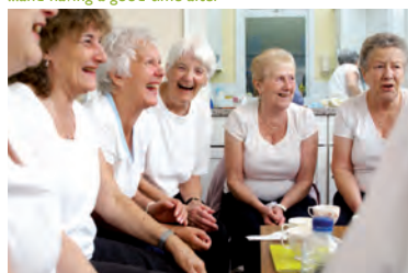
...and having a good time after