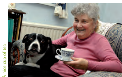
A nice cup of tea