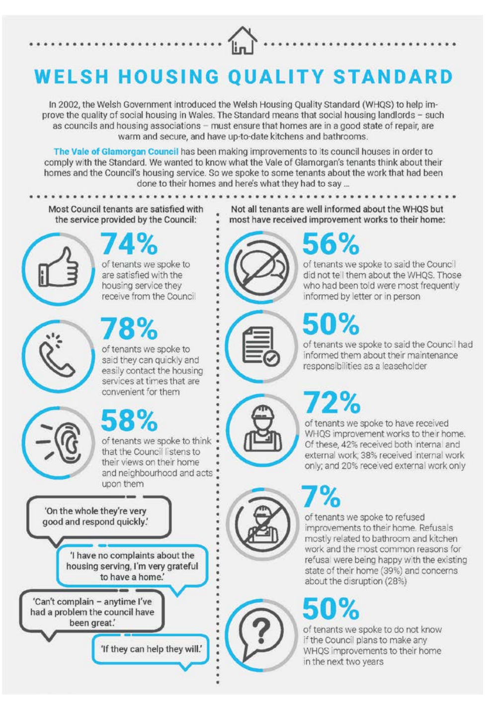
Page 14 of 16 - Welsh Housing Quality Standard review including Council housing tenants' perspective review – Vale of Glamorgan Council