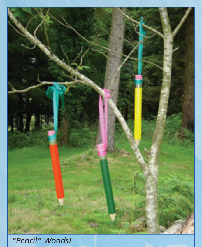
Following the first visit the children's thoughts were collected back in school and then reflected on their second visit to the woods - with ribbons tied to the trees and giant pencils hanging from the branches, as the name of the forest had been misheard as 'Pencil' woods instead of Hensol woods!

The children experienced two visits to the forest at Hensol giving them an opportunity to experience being outside in a natural woodland environment.