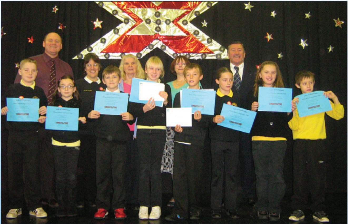
Colcot Primary receiving their award.