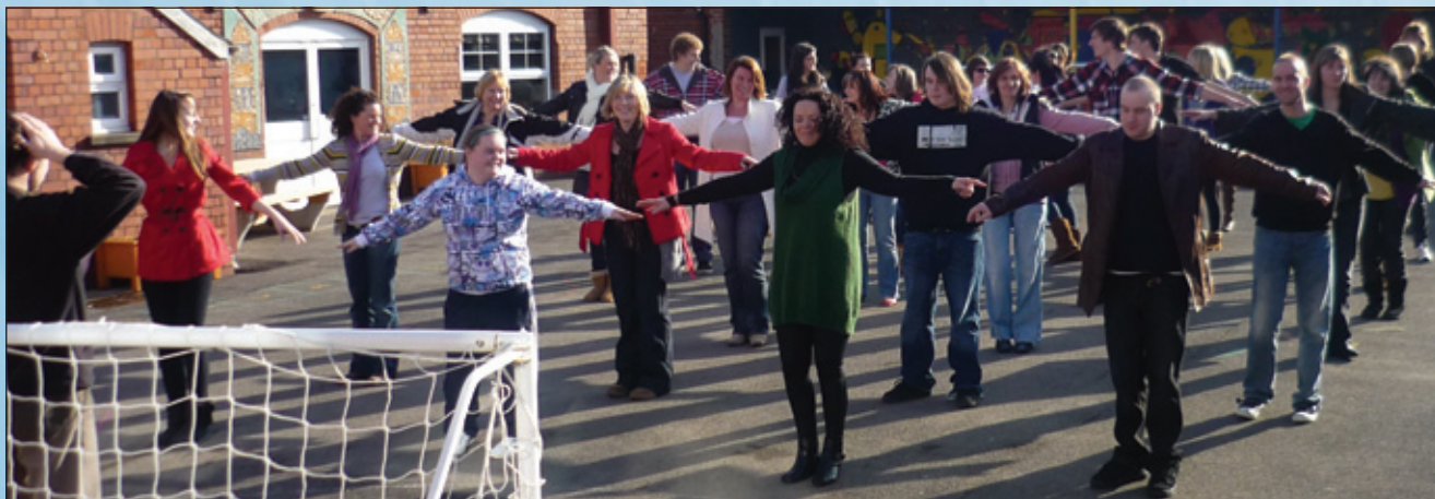
Pyramid Volunteers - 37 volunteers in Barry Island Primary School playground learning games and activities to engage with children in the clubs.

The CFS team in the Vale are working with schools to build positive partnerships with others to address the needs of children and young people out of school hours in the following ways.