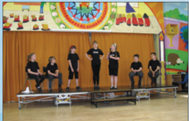
St Andrew's C/W Primary.