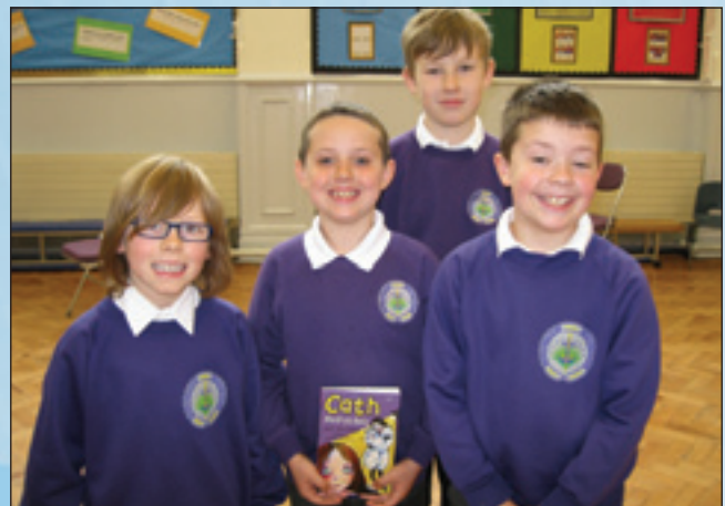
Year 3 and Year 4 Reading Team - Ysgol Sant Curig.