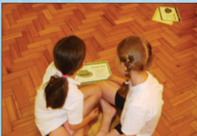
Green Hat Thinking - Pupils discussing new ideas and suggestions to overcome identified problem.