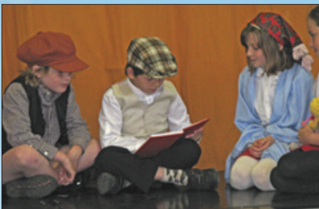
St David's C/W Primary.