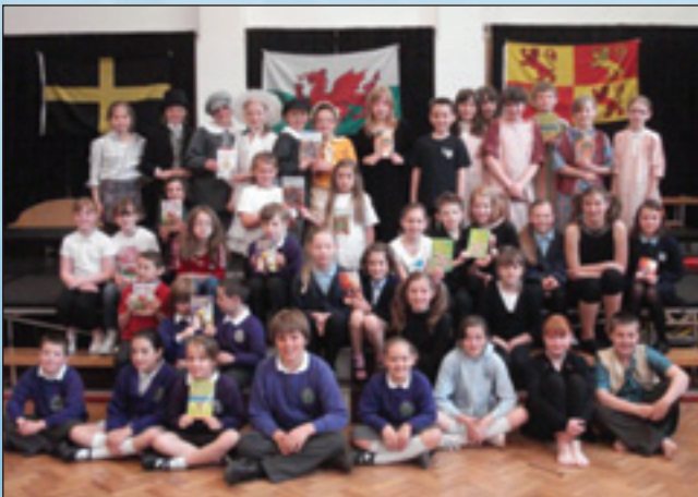
Pupils from all participating schools.