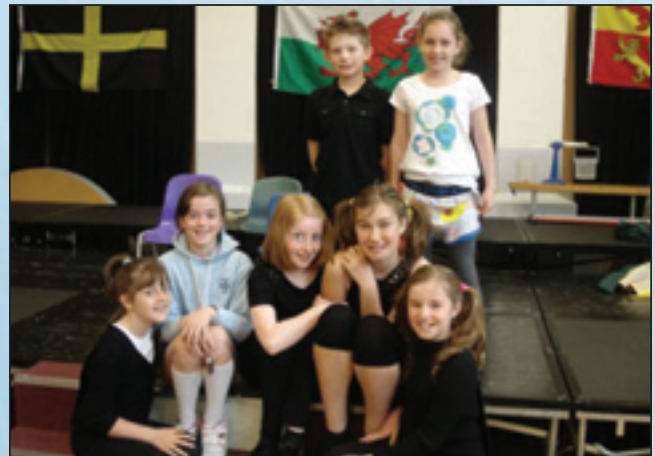
Winning book presentation team - Ysgol Iolo Morganwg.