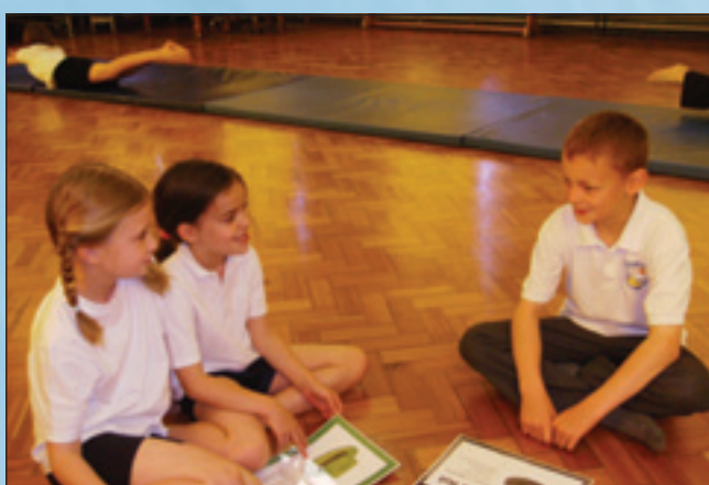
Black Hat Thinking - "I'll have to change my sequence on the apparatus. Where will I be able to roll safely?"