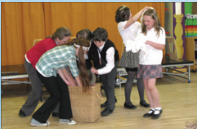
Barry Island Primary.

Congratulations go to Barry Island Primary School, who will be going on to the National round to be held at Theatr Brycheiniog in Brecon on the 25th June. We wish them lots of luck!