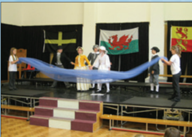
Winning presentation Year 3 and Year 4 - Ysgol Gwaun y Nant.