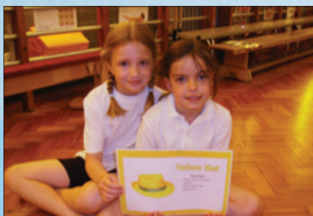
Yellow Hat Thinking - "We liked the way your sequence flowed and you showed good body tension in your movements."

One of the approaches that had been presented to the school to develop thinking was the use of Daniel DeBono's Six Thinking Hats. This theory is used across a wide range of organisations to de-compartmentalise thinking. Three of the Thinking Hats were selected to use with pupils: yellow hat thinking, looking at positive aspects; black hat thinking, identifying problems or difficulties; and green hat thinking, looking at creativity, alternatives and solutions.