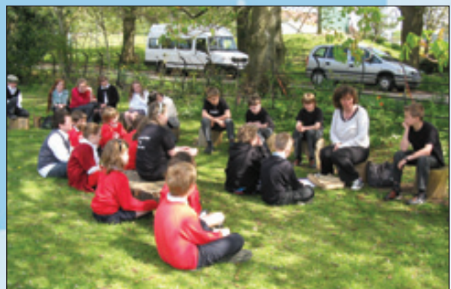
Story telling with all schools.