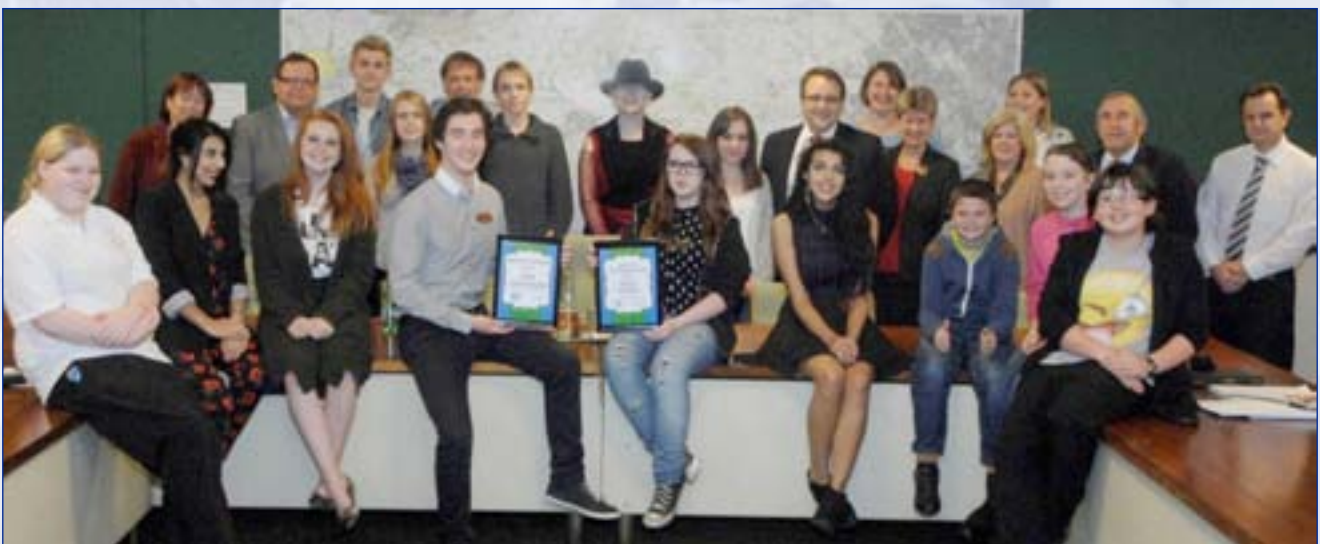
■ Vale Youth Forum.

Elections were held on 32 different occasions in a variety of locations including schools, training providers, youth clubs and youth organisations and young people were encouraged to take part in a secret ballot. Thank you to all the partners and professionals who have supported the Youth Mayor Election campaign and enabled young people to watch to the Youth Mayor manifestos and vote. In total there were close to 2800 votes and the announcement was made at the Vale Youth Forum