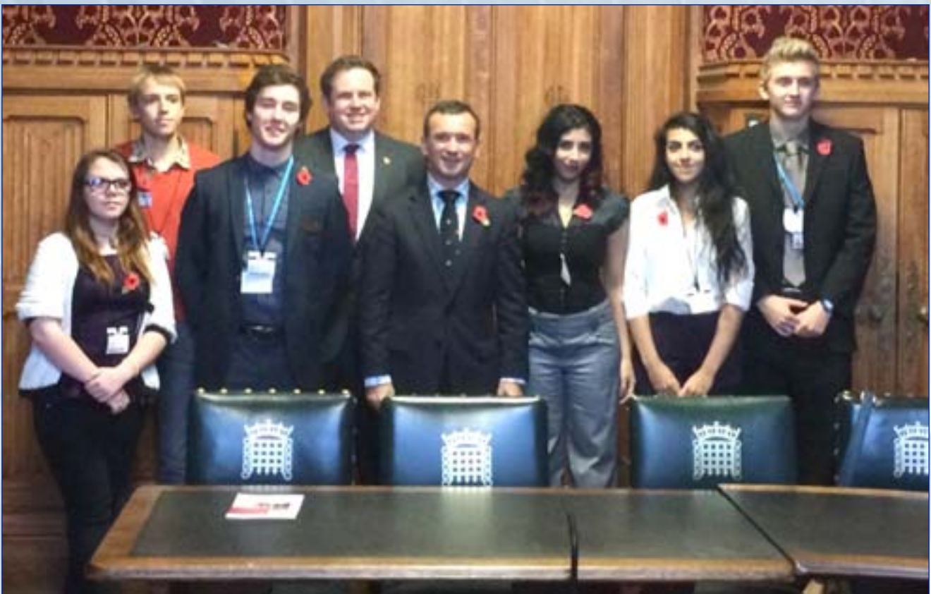
■ Vale Youth Forum.