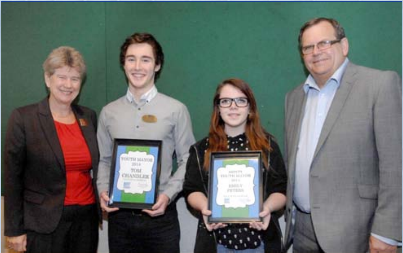
■ Vale Youth Forum- First Youth Mayor and Deputy.