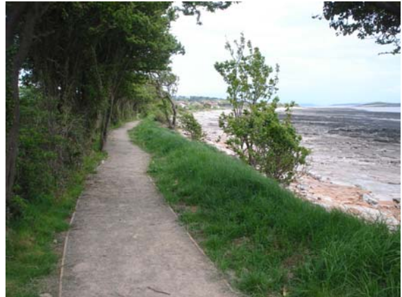
Sully (setting in)