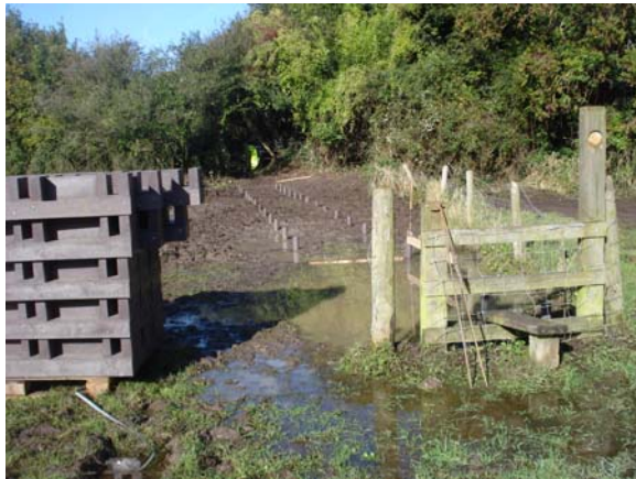
Llancadle Boardwalk - 1 st day

As regards the ROWIP , members were reminded that 2 boardwalks had been completed and work on installing 150 waymarkers would be completed in February 2010.