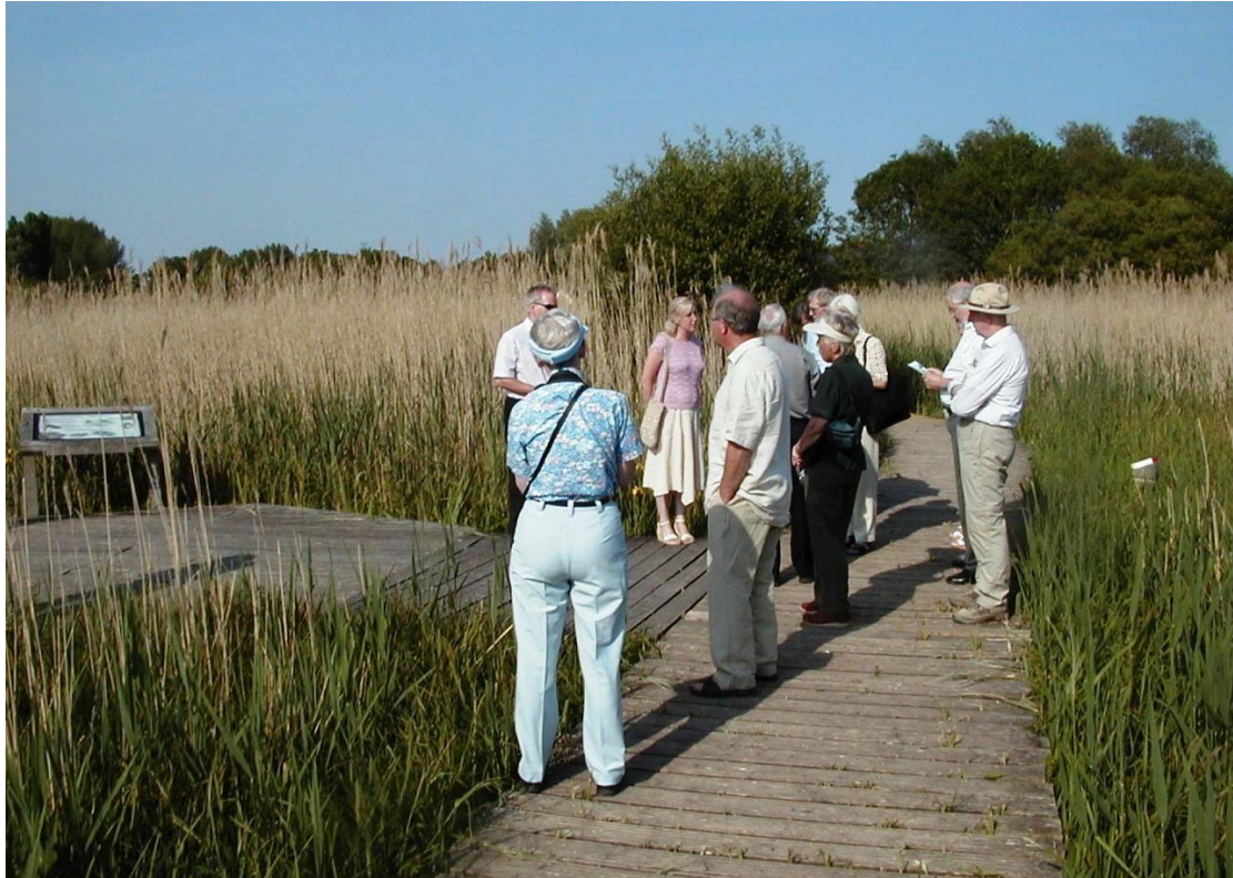
(Photograph – LAF Members and officers prior to the June 2006 meeting at Cosmeston Lakes Country Park.)

Again, at the June 2006 meeting, the Forum was advised by the Deputy Chairman that, in conjunction with the Cardiff Institute of the Blind, a walk had been undertaken to the Cosmeston Lakes Country Park, with a view to ascertaining how people with poor sight could cope with country walks. As a result, it was agreed that information for the visually impaired on walks would be addressed within the preparation of the Rights of Way Improvement Plan (ROWIP).