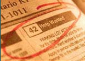
Job Shop Extra is on the move.