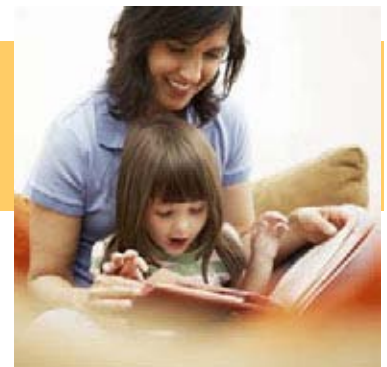
A rewarding career