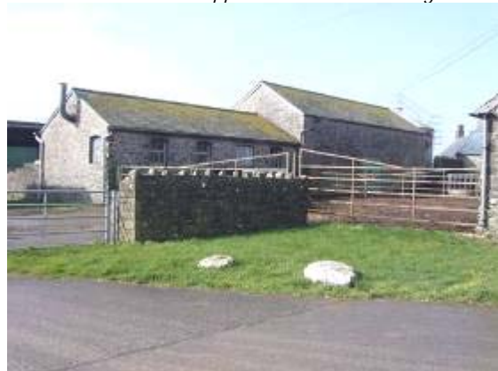
Stone walls under slate roofs typify the area's farm buildings.