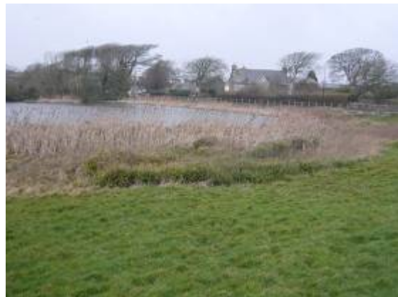
Pitcot Pool is the defining feature of the area attractively framed by reeds and bulrushes.