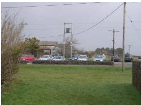
Telephone and electricity wires spoil the street scene.