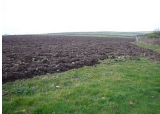
There are far-reaching views across the fields to the west.