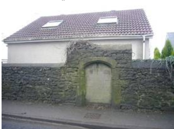
Some modern developments are out of keeping.