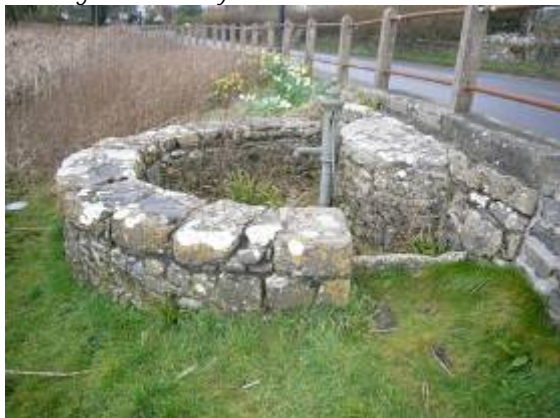
Pump erected to commemorate entry into the best kept village competition 1992.