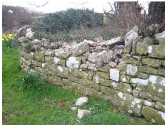
Stone wall in need of repair.