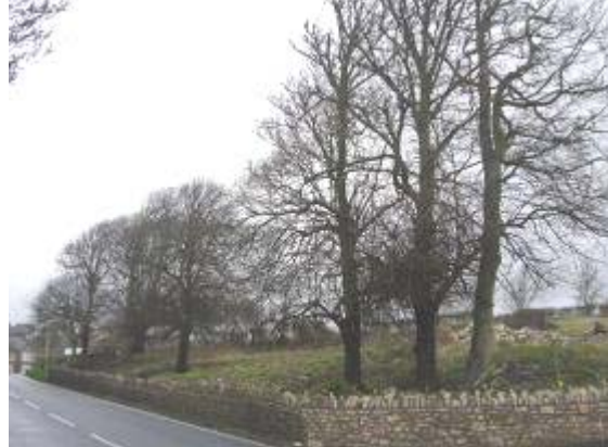
Trees on the southern approach to the main village.