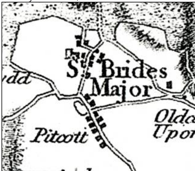
Yates' Map of Glamorgan 1799 (part)

Today the village, much enlarged by 20 th century residential development that has swamped the village's historic core around St. Bridget's Church but has left the conservation area relatively undisturbed, boasts a number of amenities for residents and visitors.