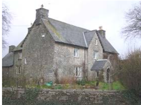
Steep gables are a feature of many buildings in the area.