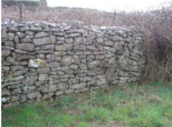
An unusual example of a drystone wall.