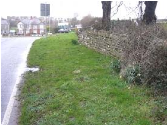
Grass verges contribute to the area's rural charm.