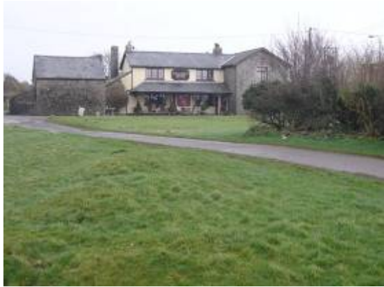
Pitcot Green in front of the Farmers Arms adds to the spacious ambience of the conservation area.