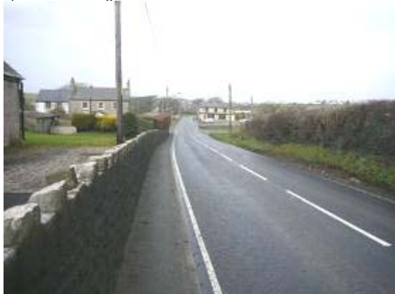
Wick Road declines slightly from Pen Ucha'r Dre to the Farmers Arms