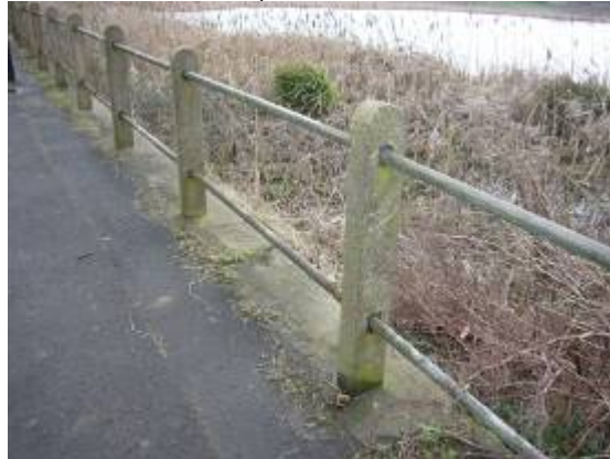
Concrete post and iron railings do not enhance the side of the pool.