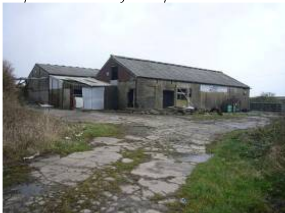
Derelict farm buildings to the east of the Farmers Arms.