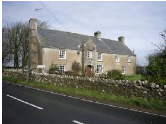
This stone building has been rendered at the front.