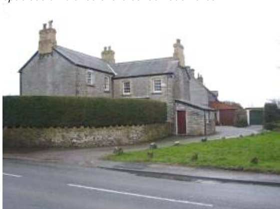
Shop Farm is a 19 th century stone dwelling with buff brick dressings and chimney stacks.