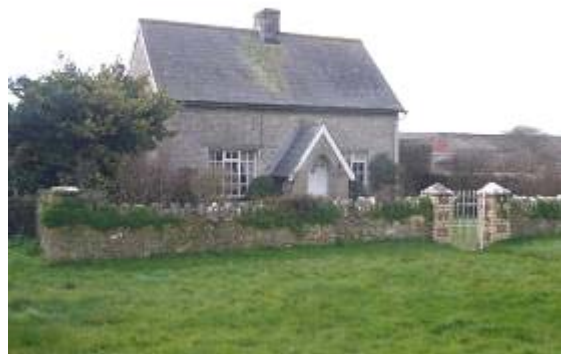
Littlewood Cottage has a fine setting well back from Wick Road.