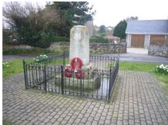
The War memorial – a County Treasure.