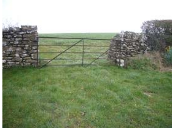
A gate leads into a field beside a wide roadside verge. Note the drystone walls.