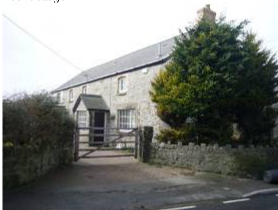
Many buildings are gable end on to the road.