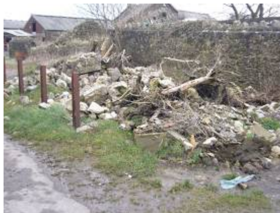
Rubbish and debris beside the lane to Castle upon Alun.