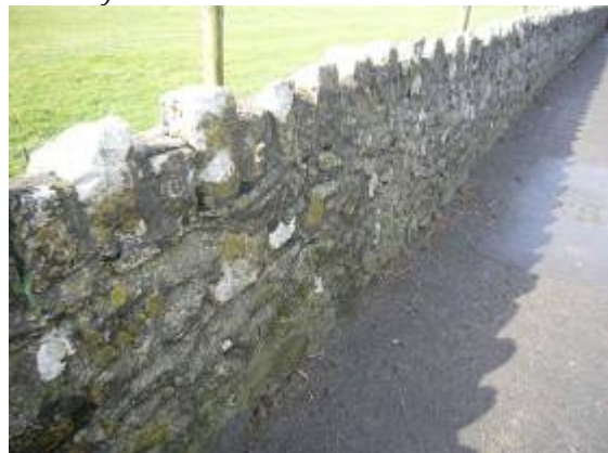
Stone walls with 'cock and hen' coping are typical of the hamlet.