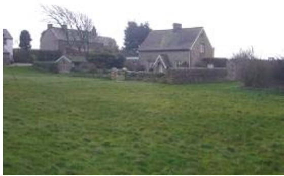
The area is characterised by clusters of buildings in a spacious setting.