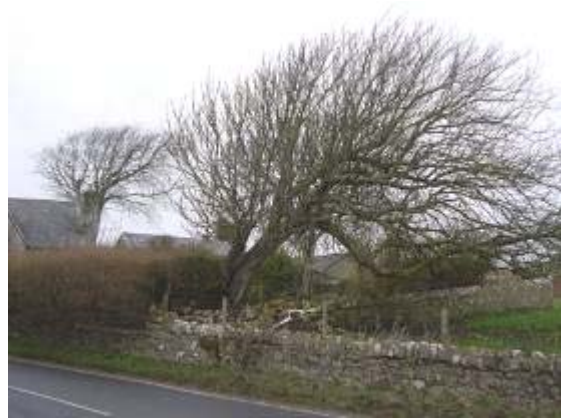
Prevailing westerly winds have shaped local trees.