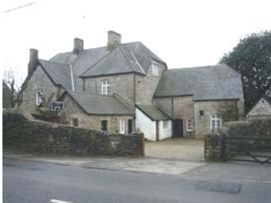
The Old Vicarage, grade II, is a Victorian vicarage dated 1848.