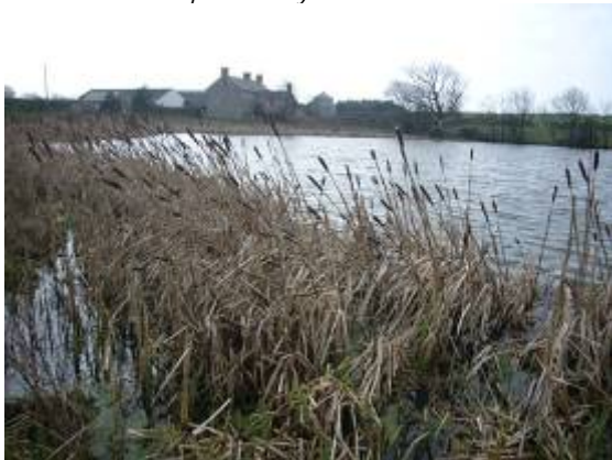
Pitcot Pool is a haven for wildlife, especially waterfowl.