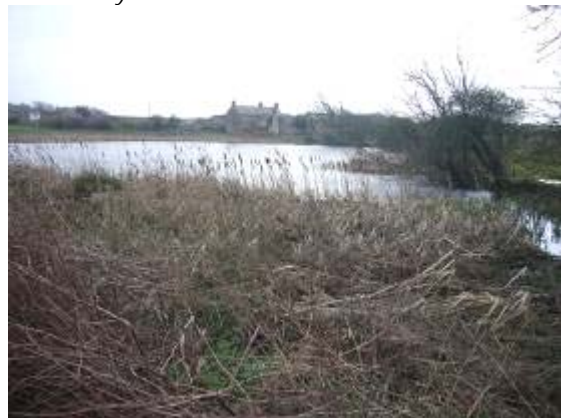
The pool lies below the level of Wick Road.