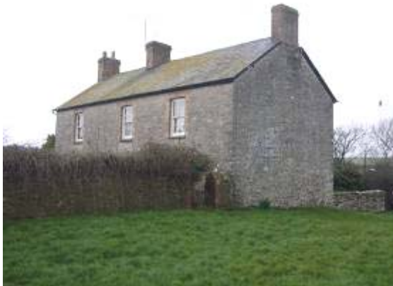
Pool Farm stands beside a grassy fringe to Pitcot Pool.