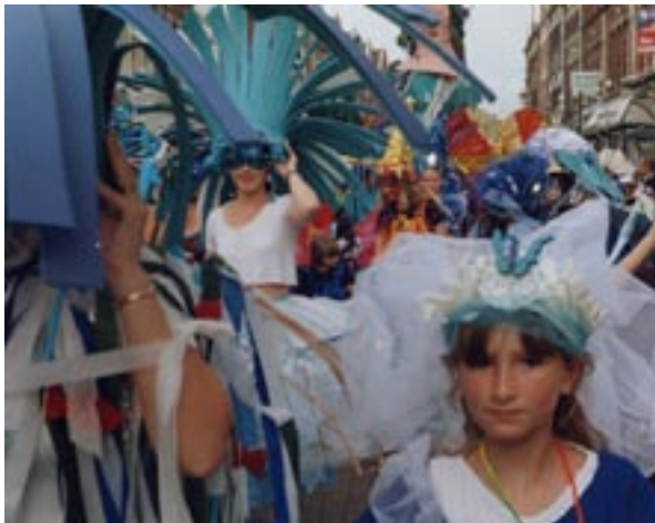
Image: 'SWICA - Barry Carnival Procession', Photo: Tracey Harding.