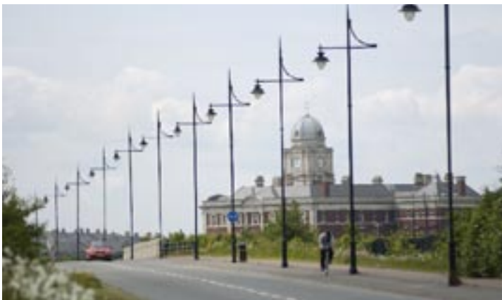
Image: Approach to Barry Waterfront.