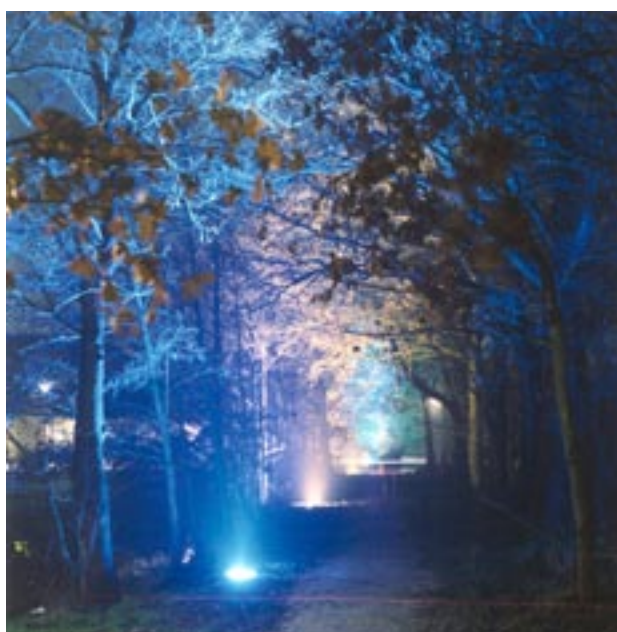
Image: Northern Lights, Lillian Roosenboom, The Netherlands © courtesy of the artis and CBAT.

Maintenance does not need to be a burden. Careful planning during the Commissioning Process appropriate precautions and the effective identification and application of resources are crucial in avoiding the pitfalls.