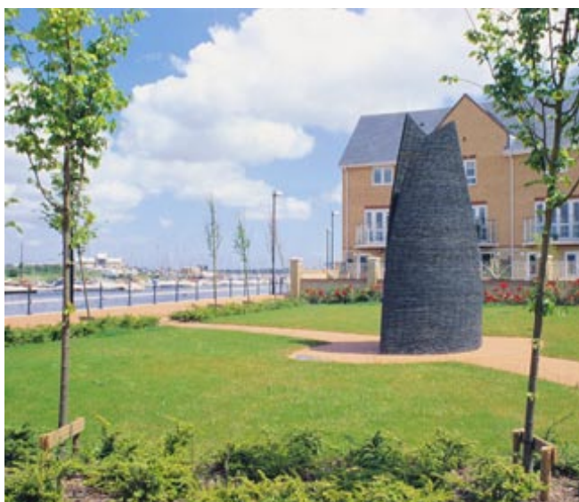
Image: Howard Bowcott, Sea Sails, Penarth Marina, Photo: Betina Skovbro © courtesy of CBAT.