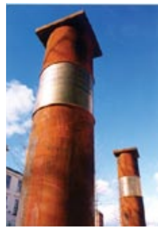
Image: Stefan Gec, Deep Navigation, Cardiff, 2001.

Whilst the traditional notion of public art as a statue on a plinth can still be effective, the integration of public art within developments, design and features has seen a diversification in public works of art. Public art is now found in the form of seating, street furniture, glassworks, banners, railings and security features, signage, new media, and temporary or community projects. Similarly, the lighting of architectural and other features is considered as an accessible form of public art that can also add value to the public realm by helping transform buildings and spaces. Consequently the sheer diversity of practice has brought about a blurring of boundaries between what may or may not be considered 'art'.