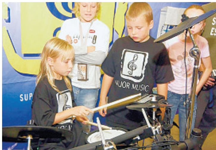
Young enthusiasts at the Major Music studio