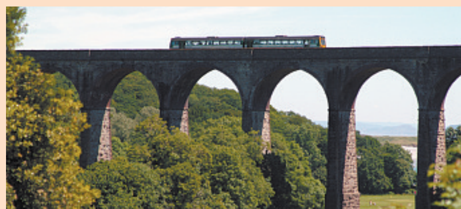
The Council has worked with partners to re-open the Barry – Bridgend railway line