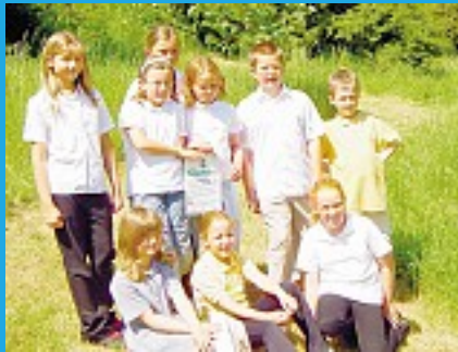
Biodiversity awards - Page 4