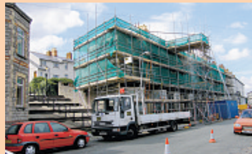
A total of £10m is being pumped into the Penarth Central Renewal Area Project

"The Council recognises that an essential ingredient in regenerating an area is the active participation of the local community, and the majority of residents have been very enthusiastic and supportive of the