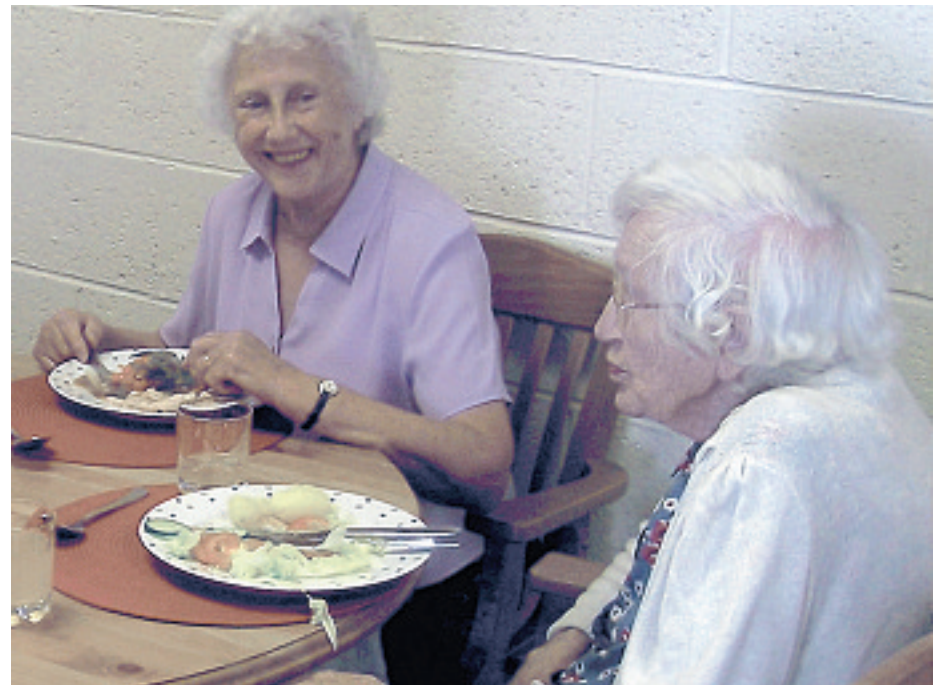
A new centre in St Athan will house day care services in the Vale