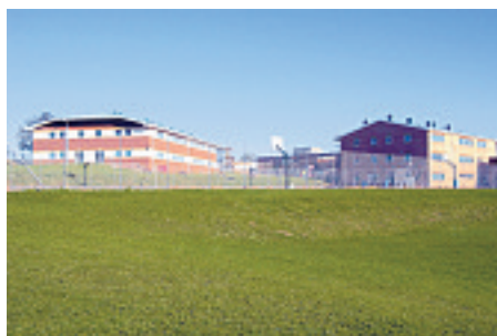
Ysgol Gyfun Bro Morgannwg - the Welsh medium comprehensive school in Barry