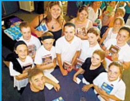
Pupils' book success - Page 2