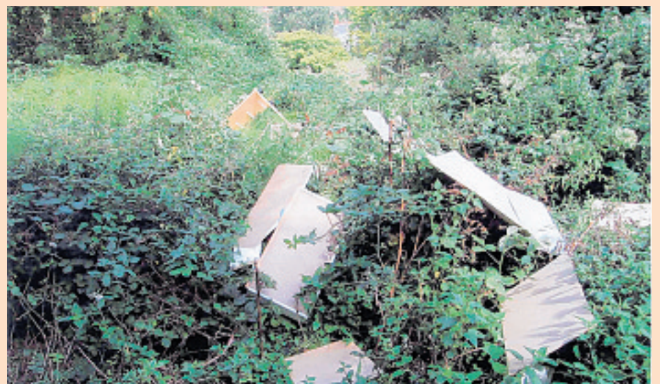
Flytipping in Cemetery Lane, Barry

If residents have evidence, such as vehicle registration numbers, that could be used to help with the prosecution of fly-tippers please call us on the number below. All information will be treated confidentially.