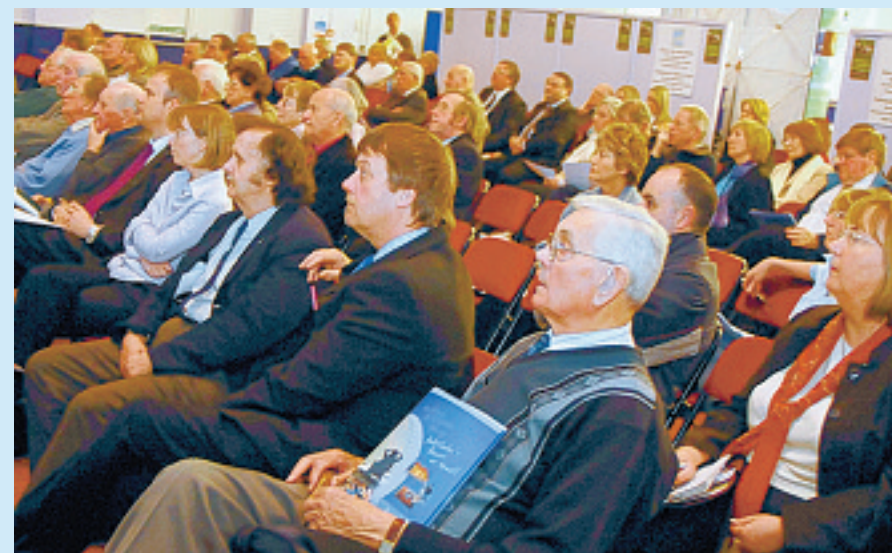
The Council has held community meetings to promote public interest in decision-making