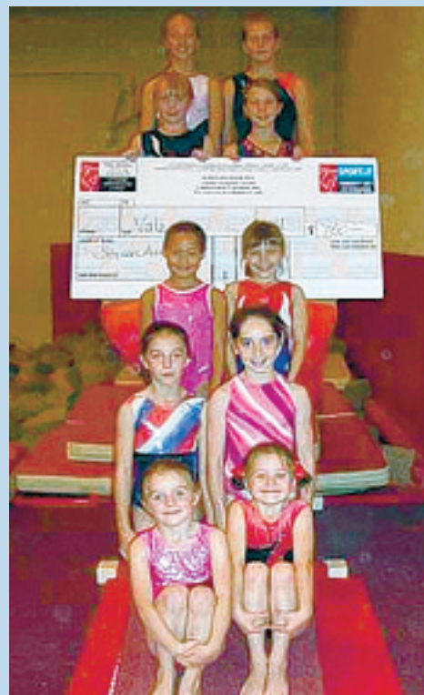
Mae Clwb Gymnasteg YMCA y Barri wedi derbyn nawdd i brynu cyfarpar ac ar gyfer hyfforddi hyfforddwyr

Panelli Cist Gymunedol sy'n rheoli'r arian ac yn penderfynu a fo prosiect yn werth ei gynnal ai peidio. Mae £55,500 ar gael o hyd yng nghronfa'r Fro ar gyfer y flwyddyn ariannol bresennol, felly os ydych wedi meddwl am ffordd o ddenu mwy o bobl i wneud