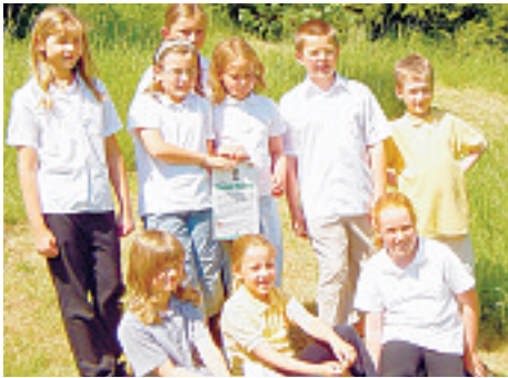
Disgyblion Ysgol yr Eglwys yng Nghymru Saint-y-brid a enillodd yn y dosbarth ar gyfer ysgolion, colegau a chanolfannau addysgol eraill