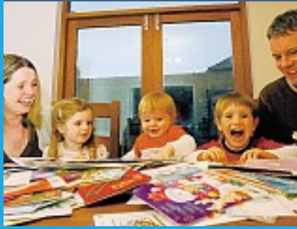
Christmas card competition - Page 6