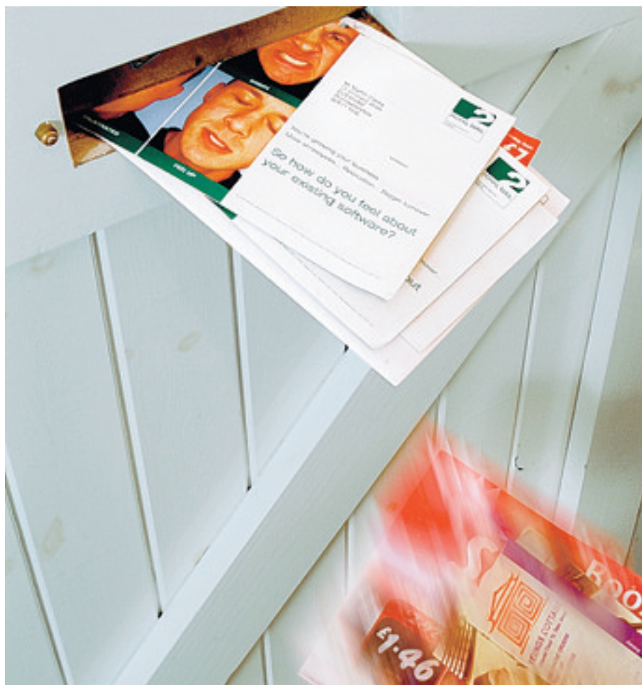
Register your details to reduce the amount of junk mail coming through your letterbox

Every year 78,000 tonnes of junk mail ends up in landfill sites around the UK.