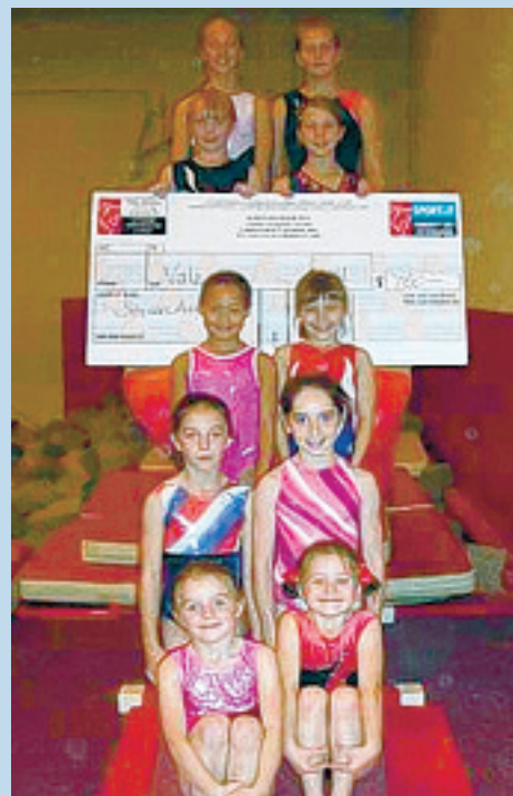
Barry YMCA Gymnastics Club has received funding to purchase equipment and for coach education

Lunchtime fitness classes, the installation of bike racks or showers in workplaces, training to become a walk leader and cycling projects in both rural and urban areas are all eligible for funding. Community Chest panels hold the purse strings