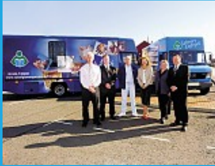
New chapter for mobile libraries - Page 8