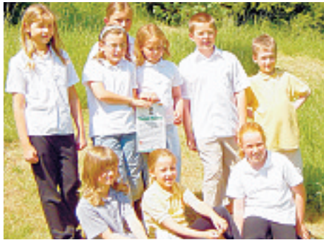
Pupils at St Bride's Church in Wales Primary School, who were winners of the class for schools, colleges or other educational centres