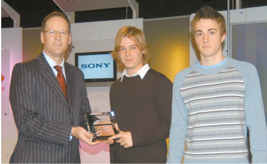
Barry Comprehensive School produced the best overall video in the annual media4schools awards.

Talented student film makers from the Vale have scooped a range of prizes in an exciting media project for schools.