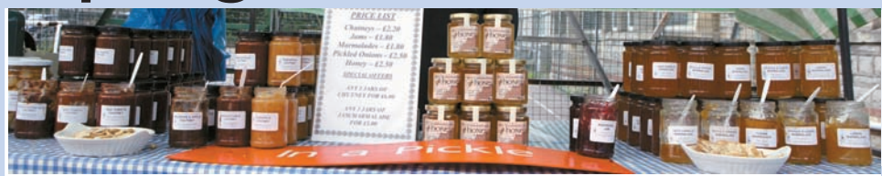
Food produce available at one of the area's Continental markets

Life in 14th Century Wales with bread baking, weapons and armour displays plus traditional medieval crafts and an Easter egg hunt! Tel: 02920 701678 for more information.