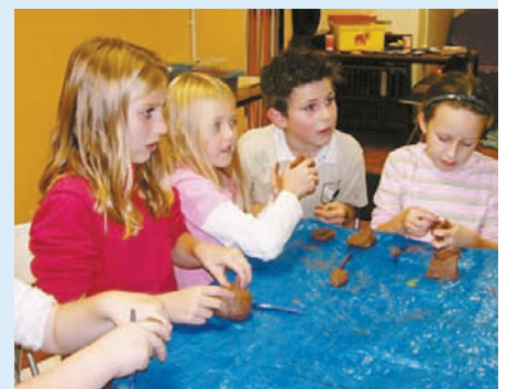
Children enjoy one of the many activities on offer at the new £800,000 centre.

Anyone wishing to find out more about the centre and current or future opportunities can telephone (01446) 793030 or email WVICCAAdmin@valeofglamorgan.gov.uk