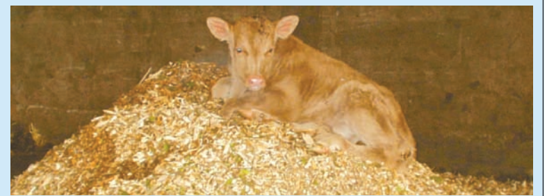
Shredded Christmas trees are being used for cattle bedding at a Vale farm.

Please remember – do not place your recycling out in black bags as these are for refuse only and will not be collected by our recycling crew.