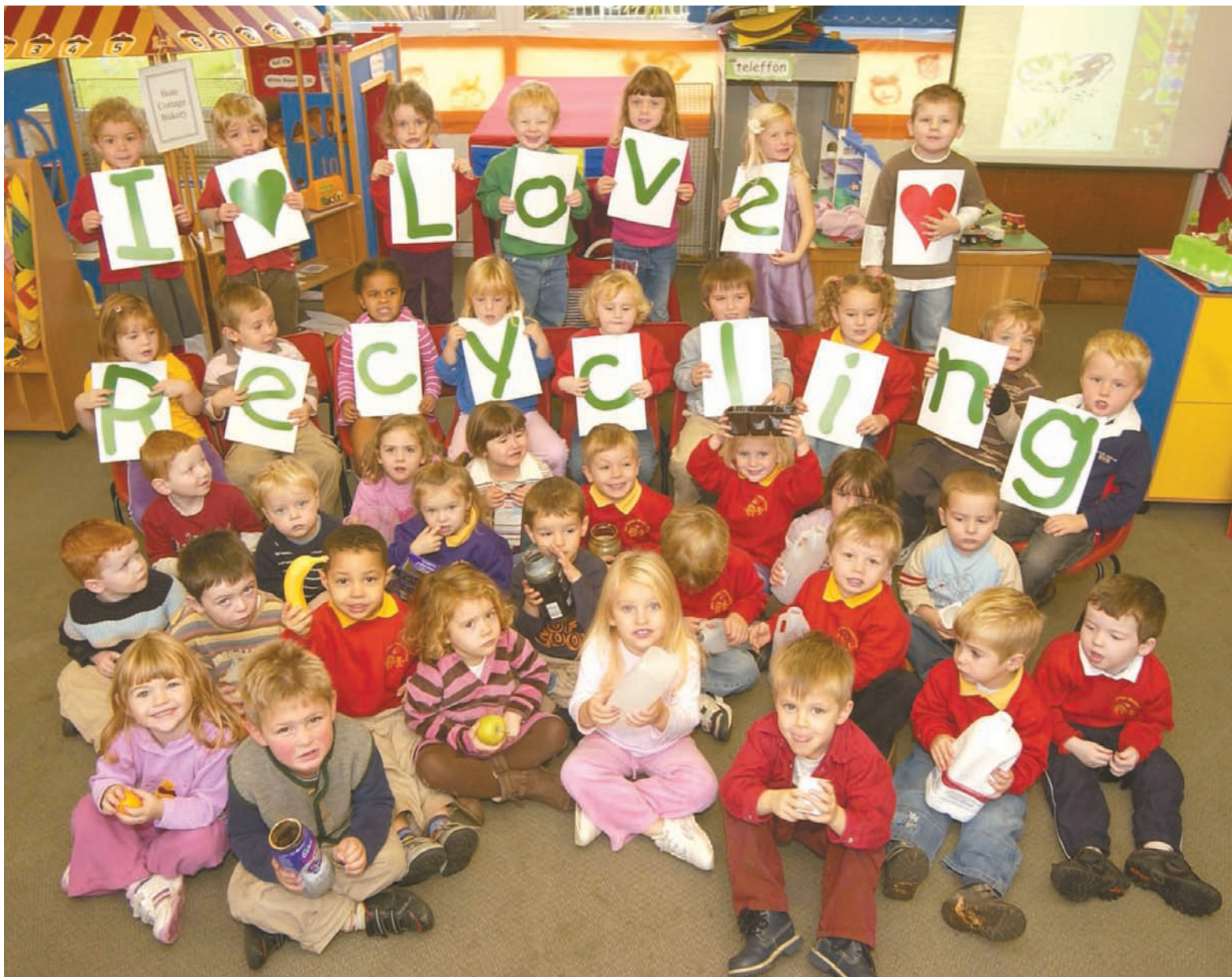
You're never too young to be "green" is the message from pupils at Bute Cottage Nursery School in Penarth.

The Vale of Glamorgan is one of the top recycling councils in Wales - and that's down to Vale residents.