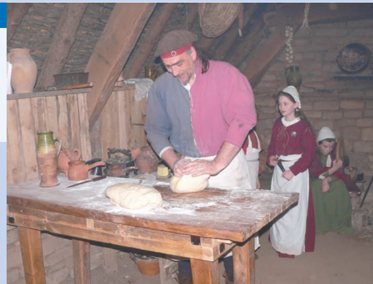
Baking on the menu at one of the themed attractions at Cosmeston Medieval Village

May Day is a time of celebration and feasting, but in the village of Cosmeston all is not well. Tel: 02920 701678 for more information.