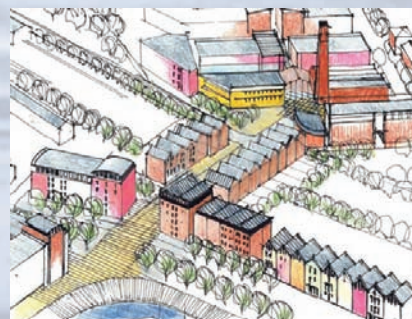
Concept Drawing: Courtesy of LDA Urban Design