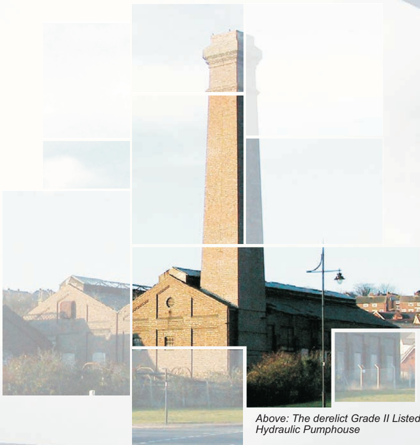
Above: The derelict Grade II Listed Hydraulic Pumphouse