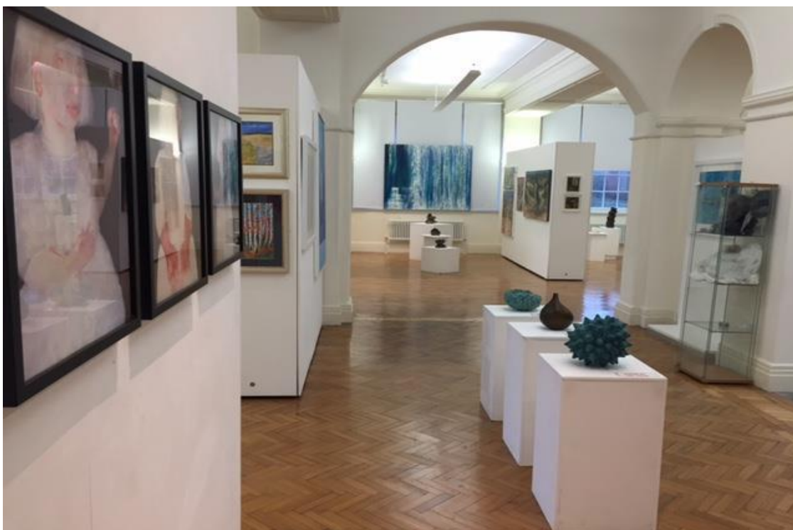
Vale of Glamorgan Council - Art Central Gallery – ‘10’ Open Exhibition 2017 Showcasing over 90 artists and 220 art works

“An Aspirational and Culturally Vibrant Vale”