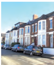
Edith Parnell HarbourView Road