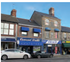
Hettie Mackenzie 107 Glebe Street