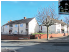
Catherine Meazey Flats