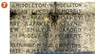
Emily Pickford War Memorial