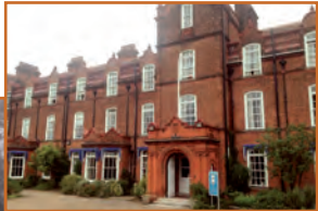
Hughes Hall, Cambridge Elizabeth Phillips Hughes