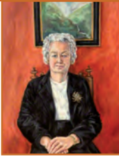
Baroness White