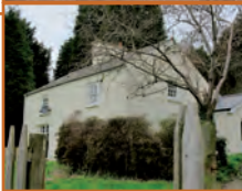
Elsie Baldwin, Porthkerry 19th Century view and Present day view