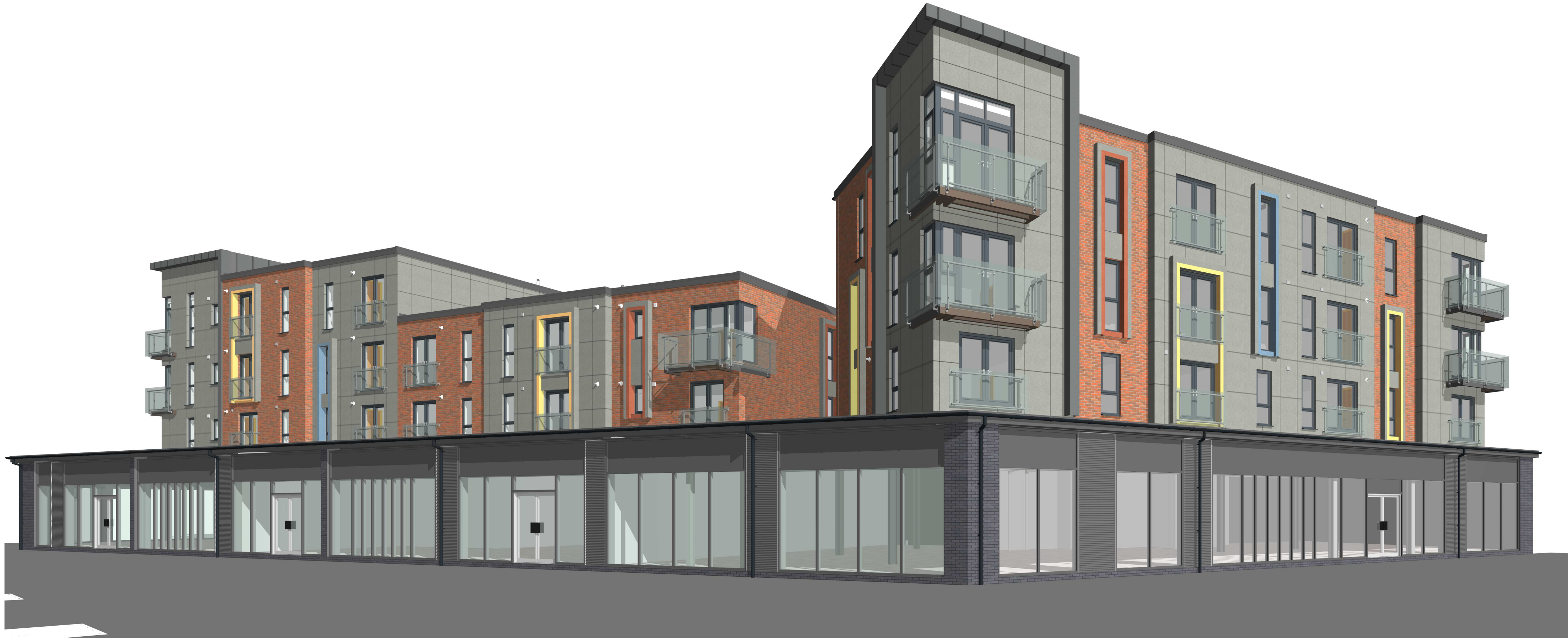
01 BLOCK C & D - VIEW 1

Notes: Do not scale this drawing. Check all dimensions on site. Any discrepancies to be reported back to the Architect for clarity.