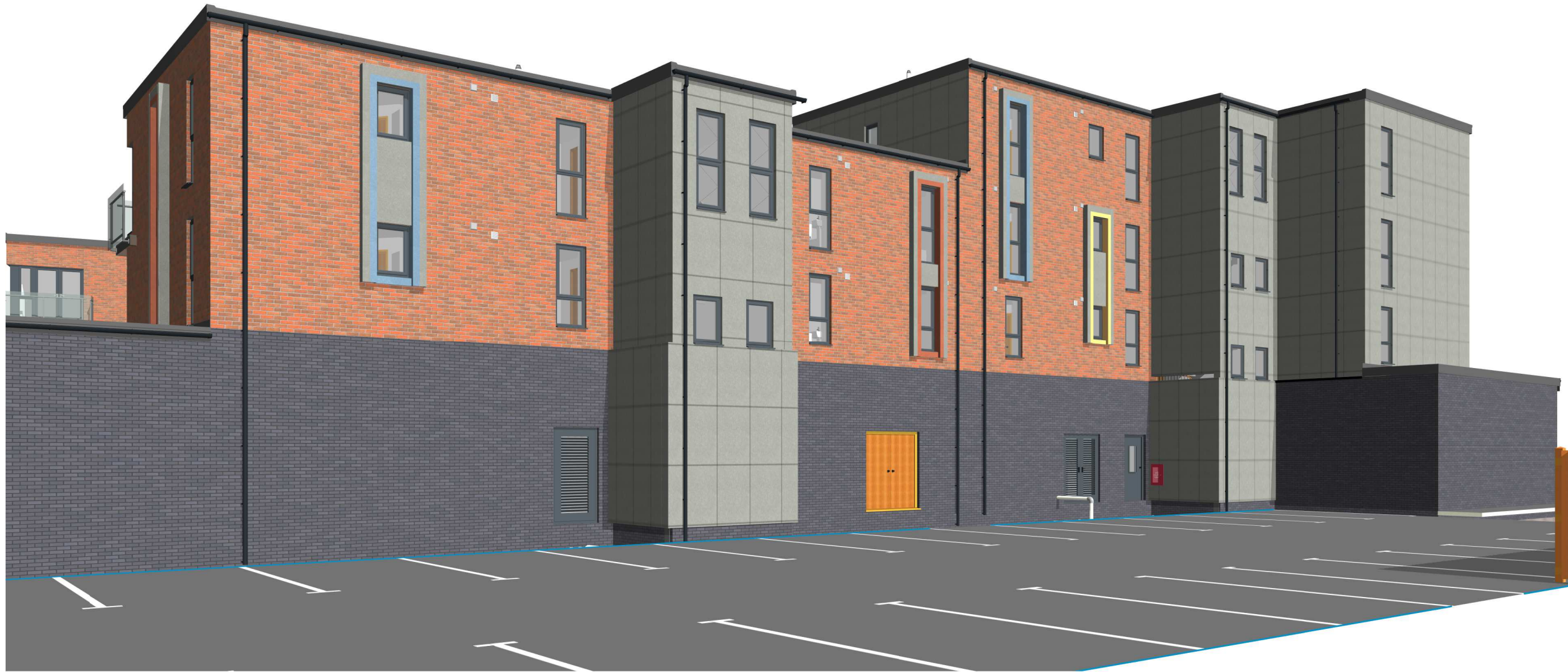
03 BLOCK C & D - VIEW 3