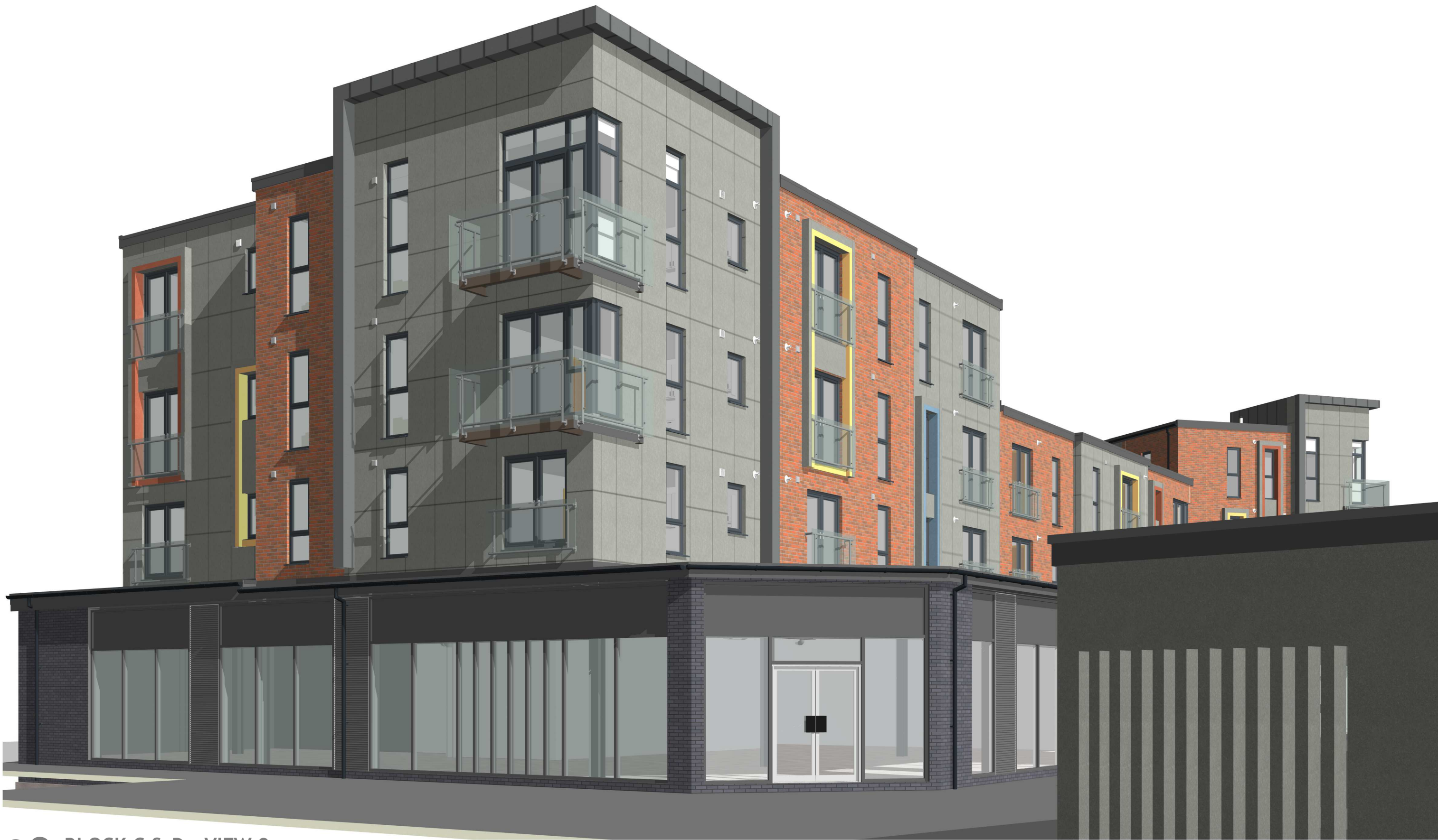
02 BLOCK C & D - VIEW 2