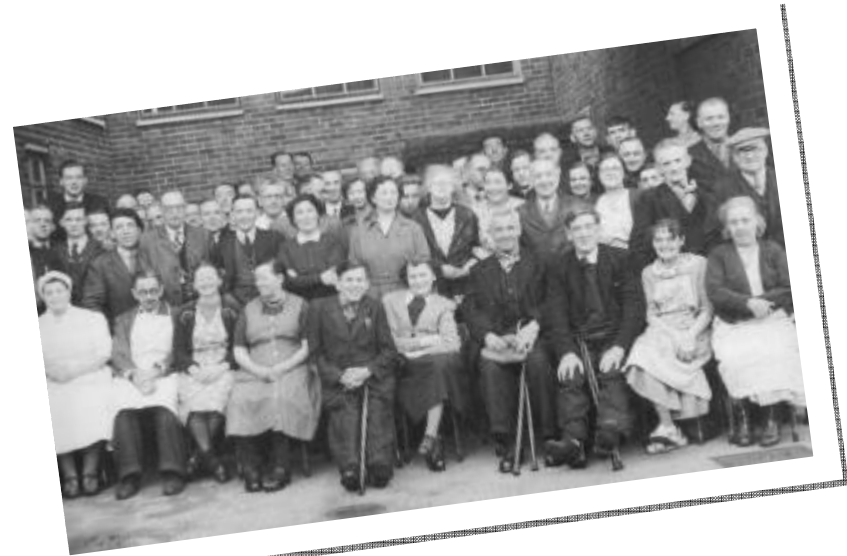
Remploy began making violins and furniture in a factory in Bridgend