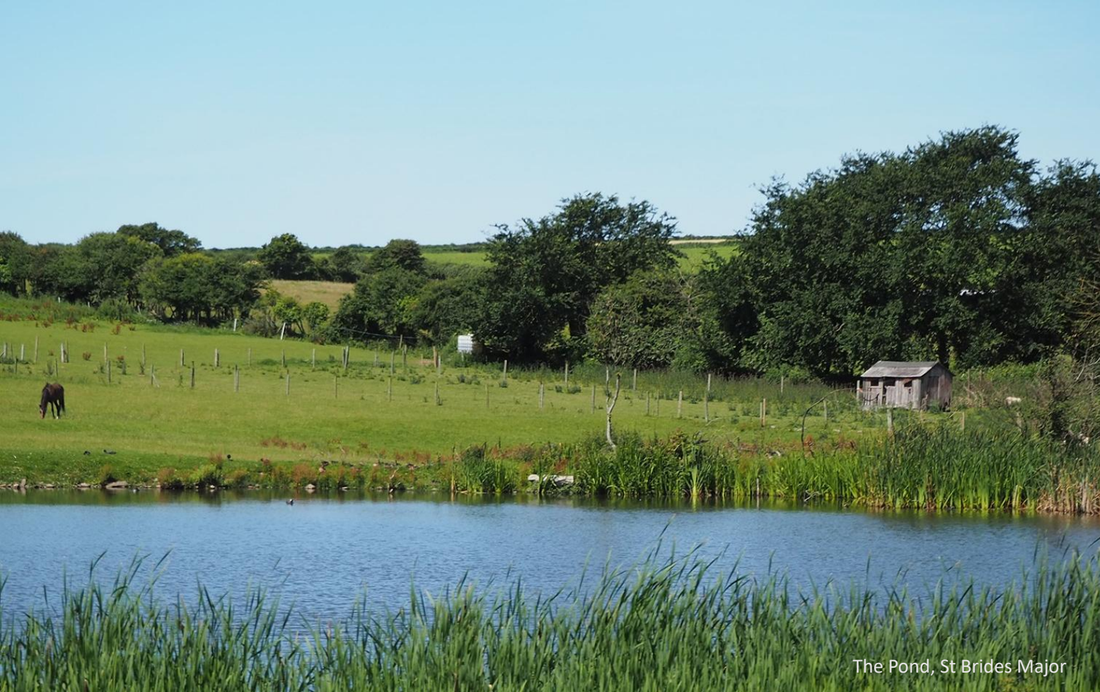
The Pond, St Brides Major