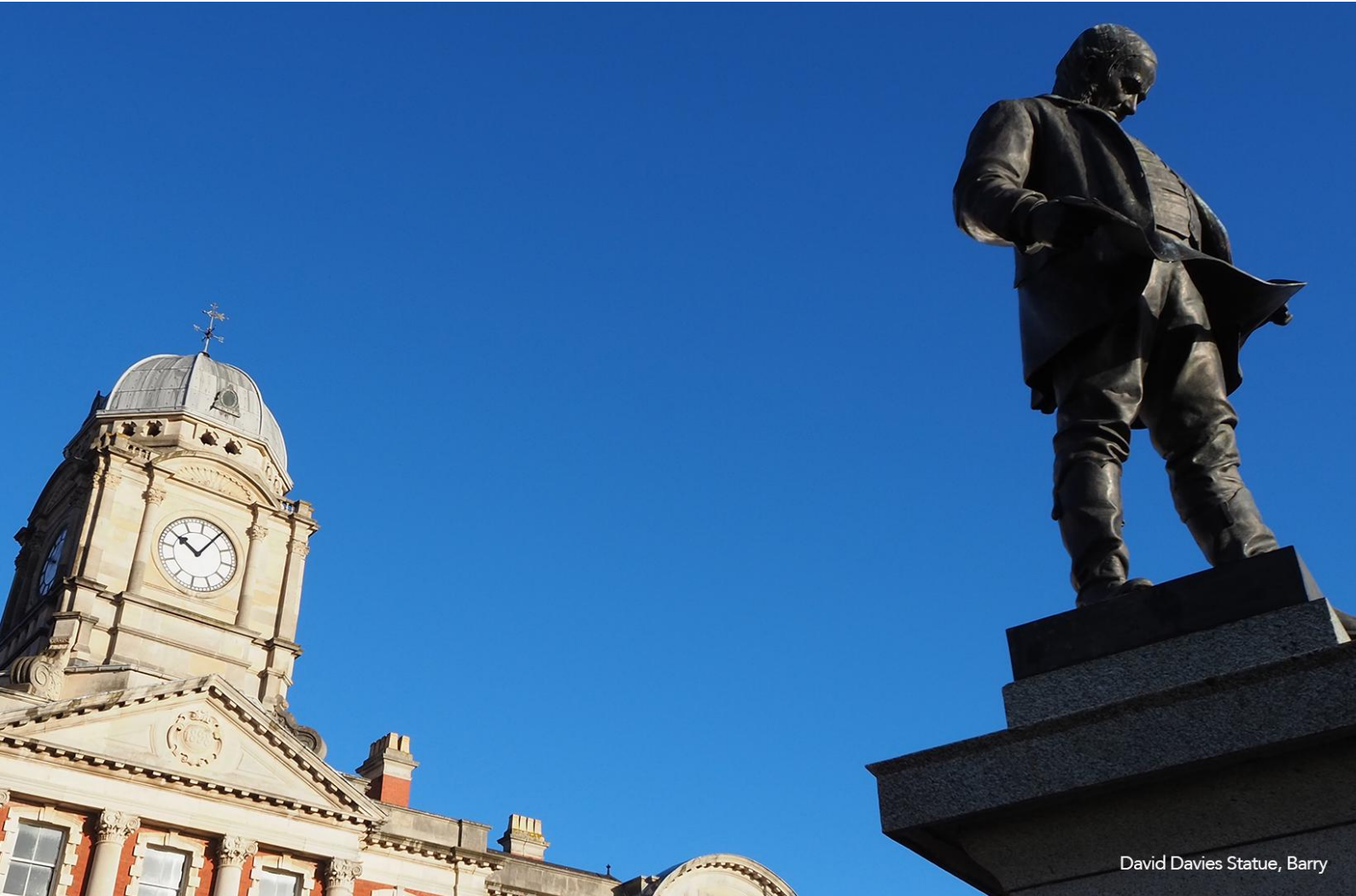
David Davies Statue, Barry