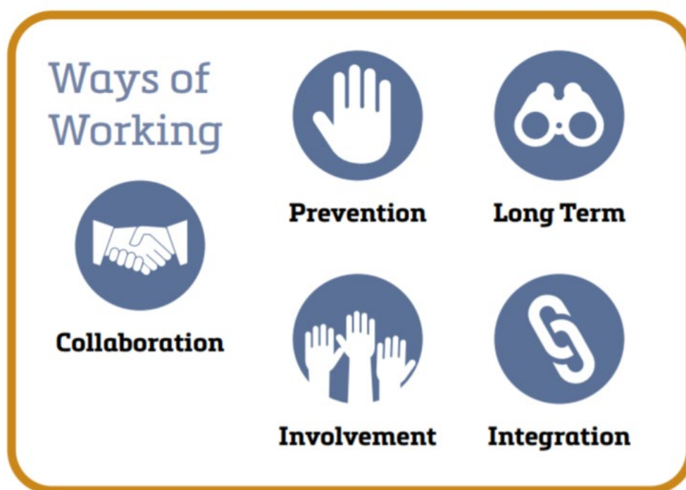
Figure 2: 5 Ways of Working