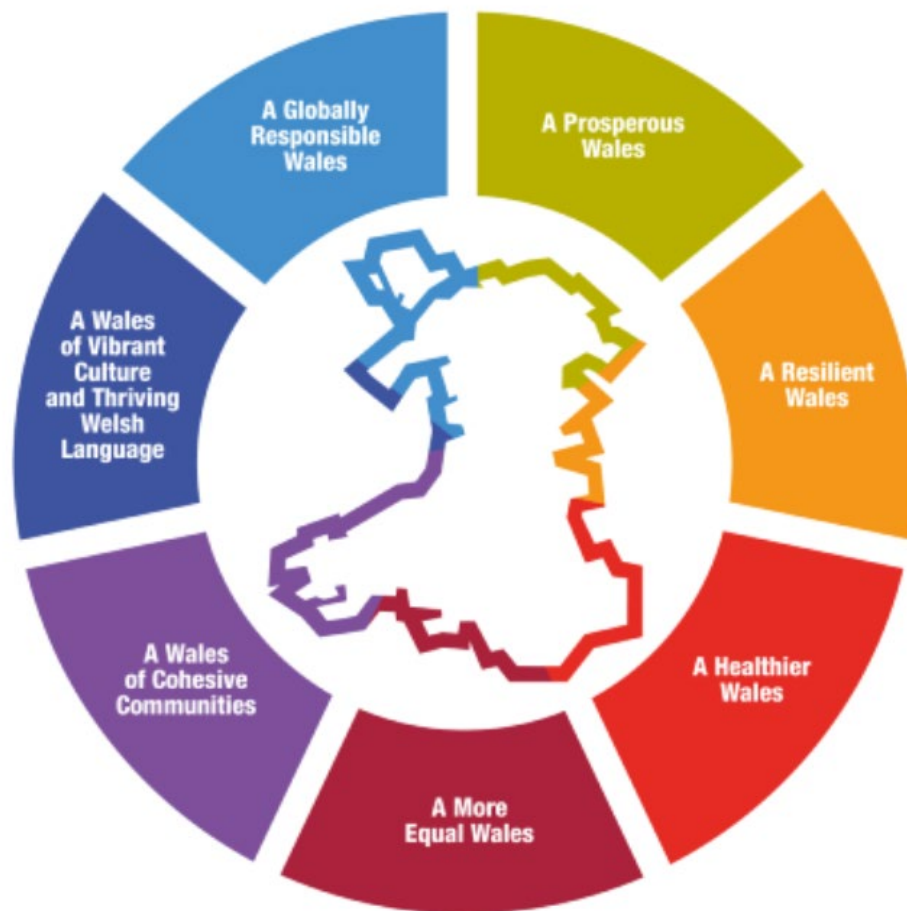
Figure 1: 7 Wellbeing and Future Generation Goals