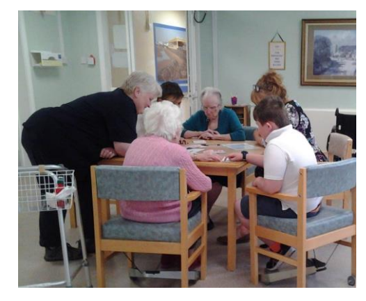
Y Bont Faen Primary pupils - arts and craft sessions