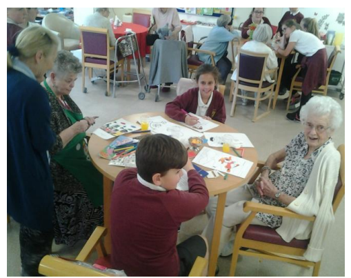
Romilly School pupils – arts and crafts sessions.