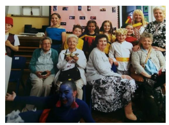
Cartref residents attended Romilly Primary School's Panto - Aladdin.

Example of letter sent to a Cartref resident from a Romilly Primary Pupil as part of the Pen Pal initiative.