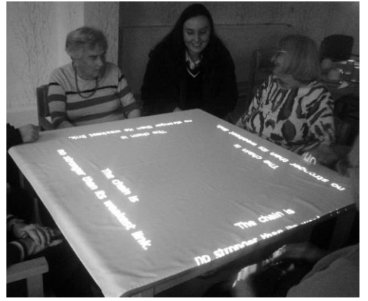
Cowbridge Comprehensive pupils participating in a Tovertafel activity with residents