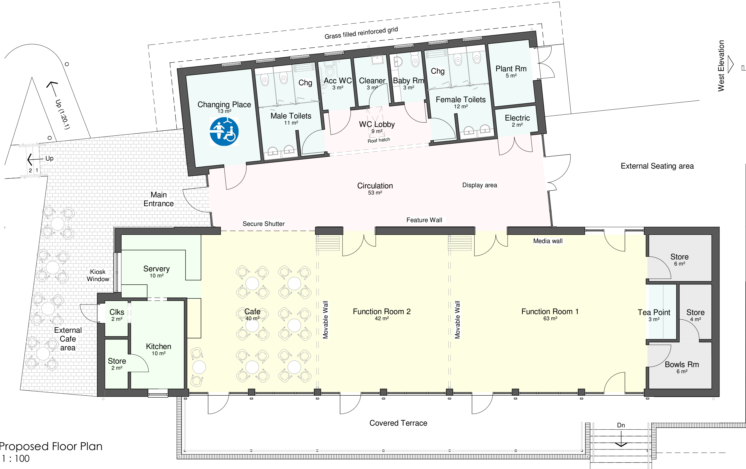
Proposed Floor Plan 1 : 100

Do not scale this drawing except for Planning Application purposes only/ Peidiwch â graddfa llun hwn ac eithrio ar gyfer dibenion Cais Cynllunio yn unig. Any inaccuracies must be reported to the Contract Administrator/ Rhaid i unrhyw anghywirdeb rhoi gwybod i'r Gweinyddwr y Contract..