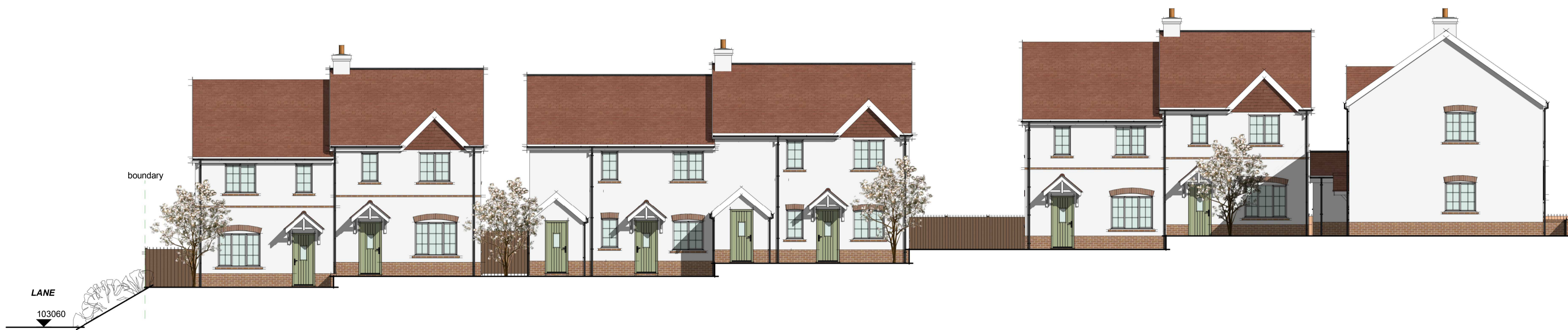
1 Context elevation 1 : 100