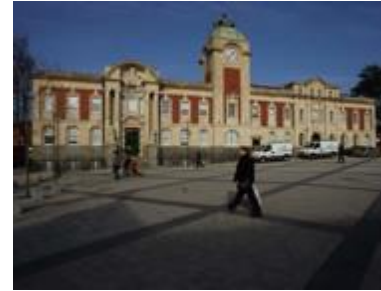
Town Hall and King Square