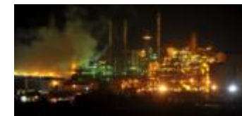
Dow Corning Works