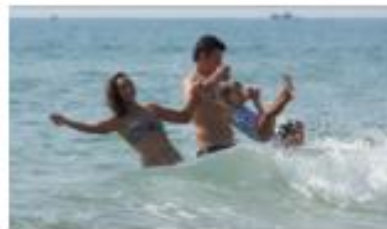
LEISURE & TOURISM