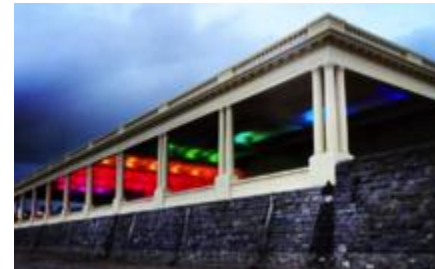
Barry Island Eastern Shelter