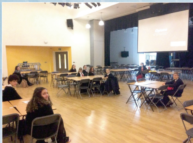
Student Ambassador Training at St Cyres School

We would like to encourage governors to speak with their schools to promote these free schemes.