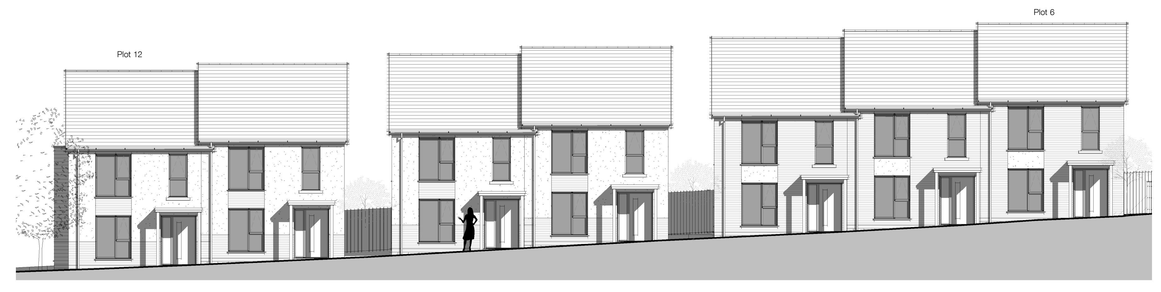
Site section 2 1: 100