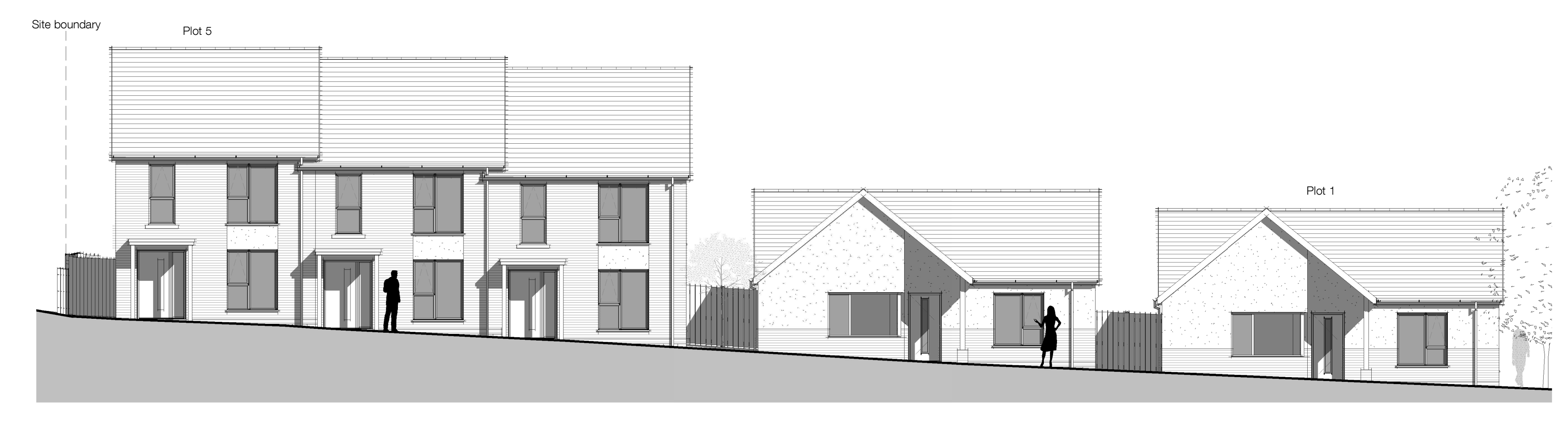
Site section 1 1: 100