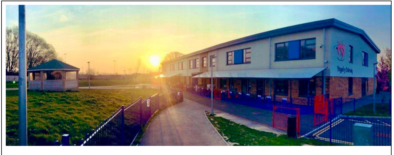
Figure 1: Image of Ysgol Y Ddraig building (outside view)

Ysgol Y Ddraig benefits from suitably sized classrooms, a main hall for sport and dining, offices for headteacher and administration, a staffroom, and break out areas for pupil interventions. The school is fenced to safeguard pupils with intercom access for visitors. Within the grounds, there are external play areas, a multi-use games area (MUGA) and habitat areas to enhance pupil wellbeing.