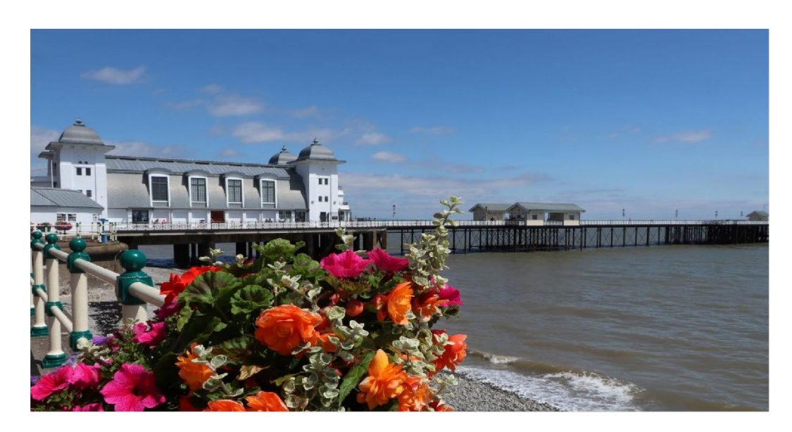
PENARTH PIER PAVILION – VENUE HIRE 2022/2023