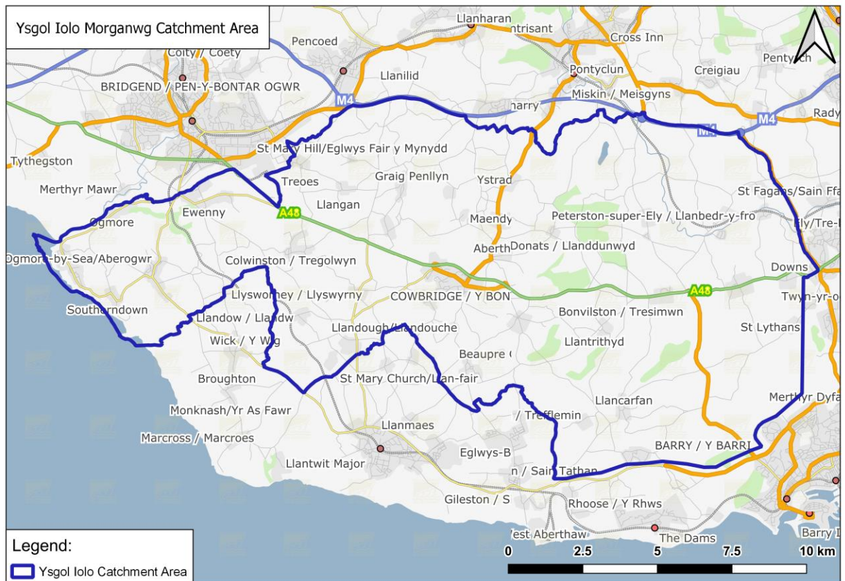
Figure 1: Ysgol Iolo Morganwg Catchment Area