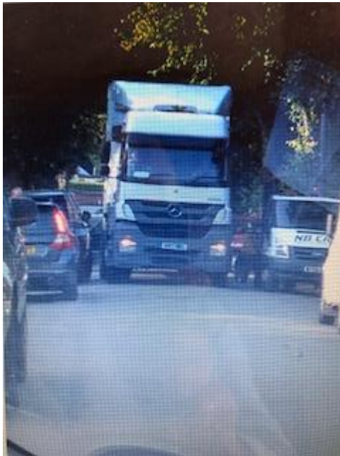
Representation 19 Continued