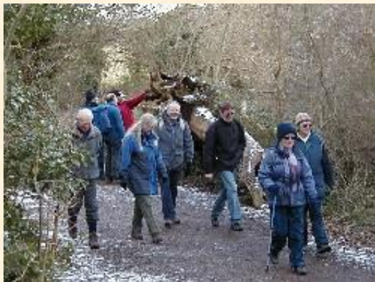
(LAF Members "on their travels")

Members of the Forum once again undertook a 5% sample survey of Public Rights of Way during the Spring and Autumn. The results showed that the overall percentage for "paths that were signposted from the road" and "paths that were easy to use" had increased compared to 2011/12. These surveys are fed into national statistics for all Welsh Local Authorities and provide a valuable source of information for the Council's Public Rights of Way team.