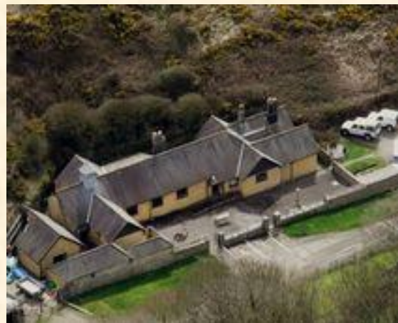
(Glamorgan Heritage Coast Centre)

Four meetings of the Forum took place during the year - in May, September and December 2012 and, finally, in April 2013. Two of the meetings were held at venues outside of the Civic Offices, enabling members to view “work on the ground”. The May 2012 meeting took place at the Heritage Coast Centre, Southerndown.