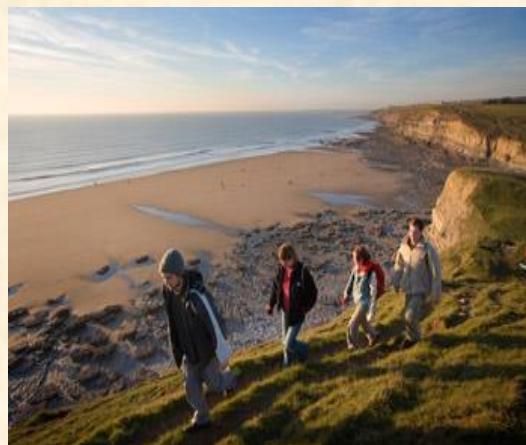
(Wales Coast Path, Southerndown)

A particular highlight was the opening of the All-Wales Coast Path on 5 th May 2013.