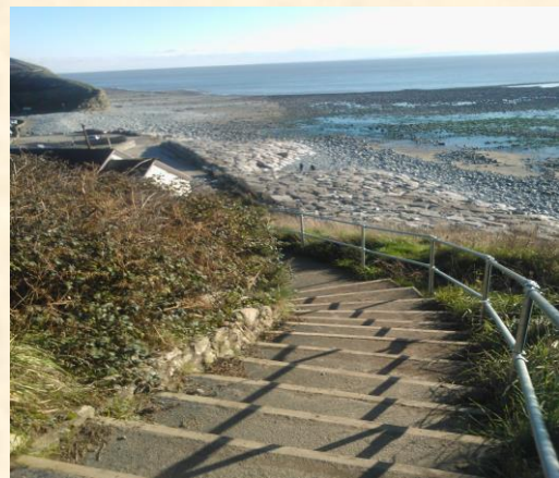
(Improvement of steps behind the lifeguard station at Cwm Colhuw)

The Chairman continues to represent the Forum at meetings of the Welsh LAF Chairs and on the Rural Development Plan Footpath Grant scheme. The Vice-Chairman is actively involved with the Steering Group which promotes Walking in the Rural Vale.