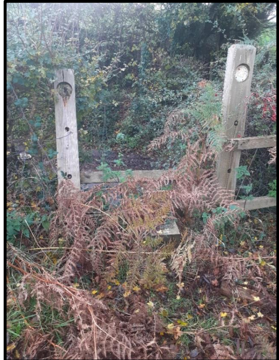
Poor condition of existing stiles - badly deteriorated