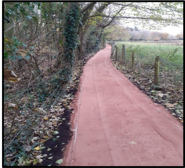
St. Andrews footpath improvements (before & after)