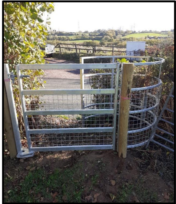
New kissing gates installed – galvanized steel