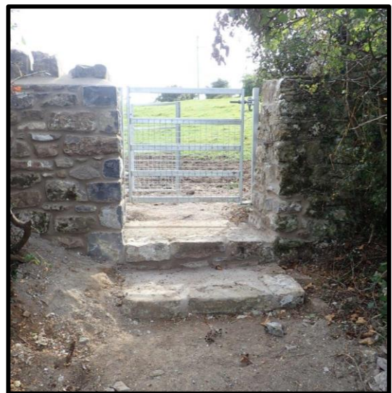
Replacement of old stone style