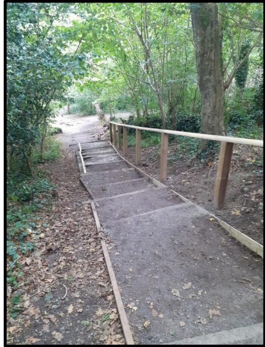
Step and handrail replacements