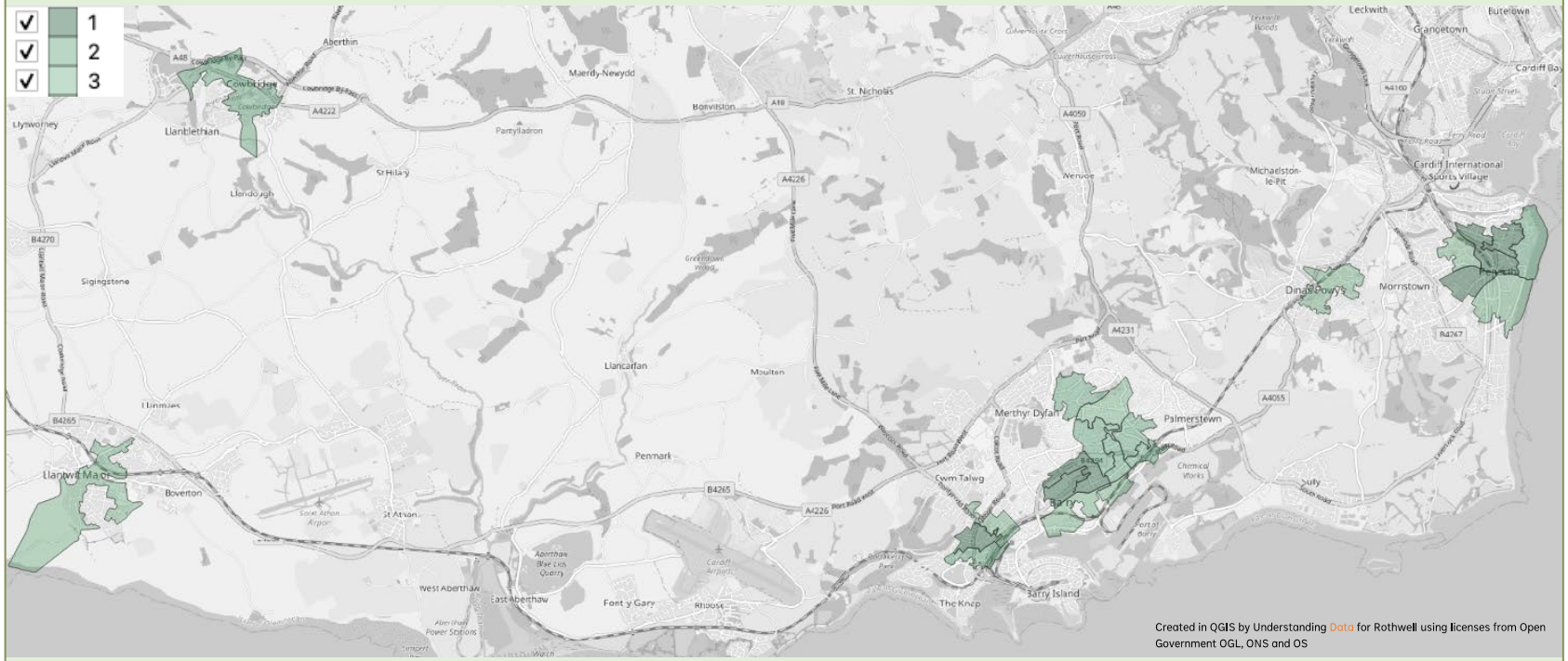
This shows the worst three percentiles (30%) for access to green spaces from the Access to Healthy Assets and Hazards dataset. It is a measure of active and passive distance from accessible greenspace (See note2)