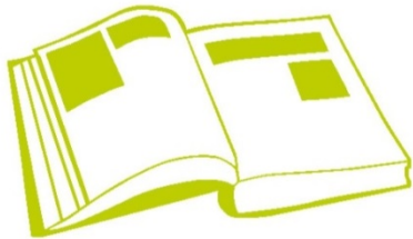
A new Corporate Plan

Embedding the Act in the various work of the Council has required new ways of working: