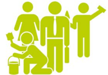
Reflecting the Five Ways of Working in all work