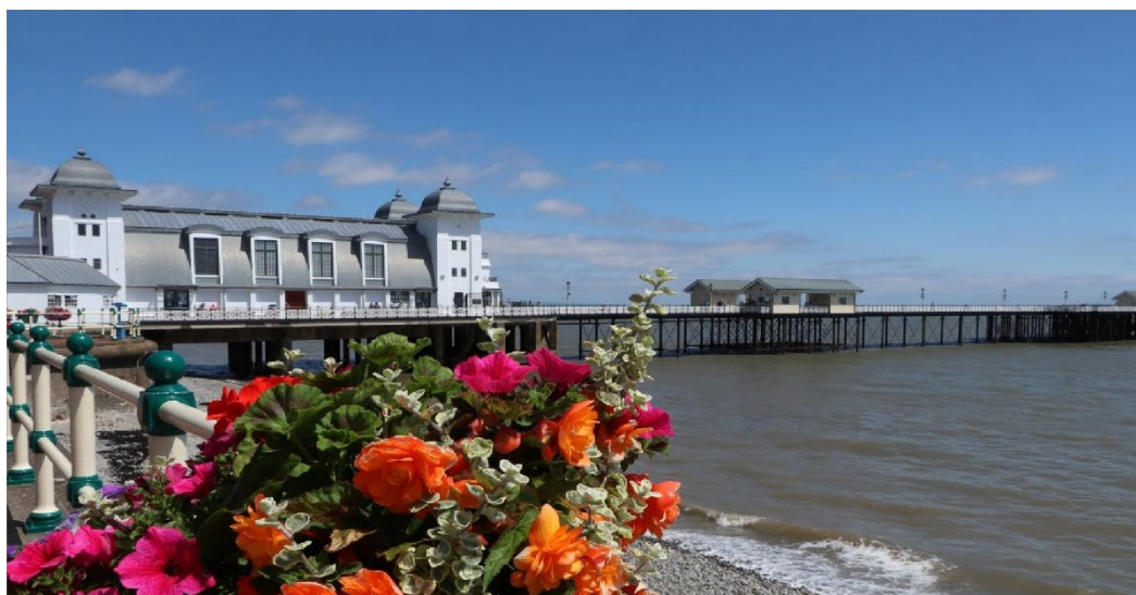
PENARTH PIER PAVILION – VENUE HIRE 2022/2023