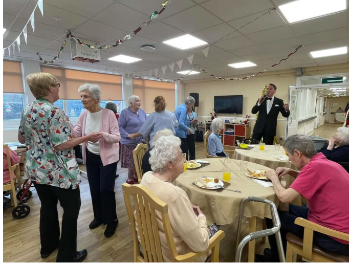
1 – Care home residents enjoying entertainment.