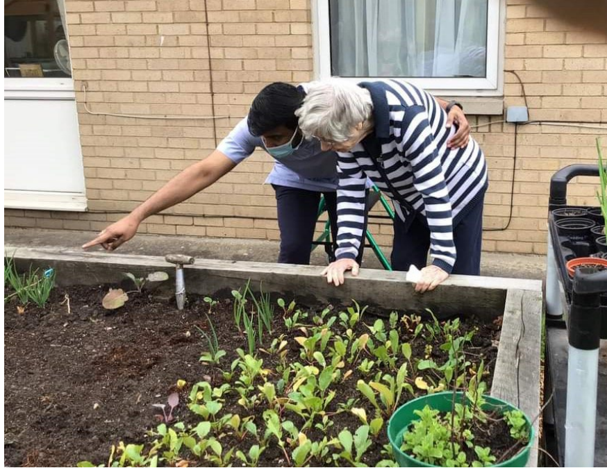
Care Home resident and staff enjoying new garden project