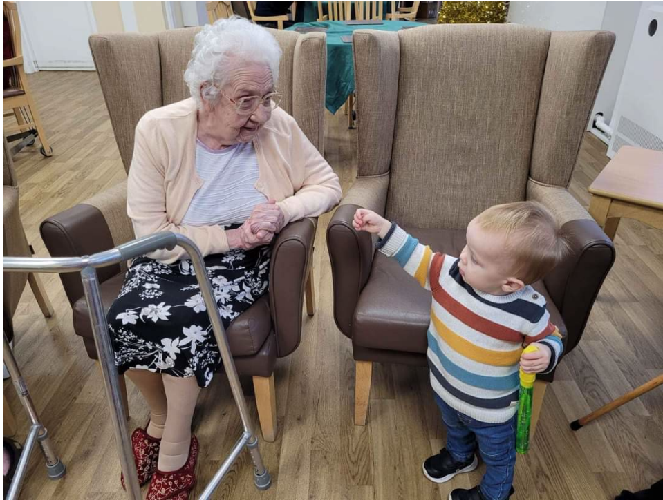
2 - Care home resident visits.

This section of the report sets out our performance in promoting and improving the key aspects of well-being of people in the Vale of Glamorgan who need care and support and carers who need support in relation to the six well-being standards.