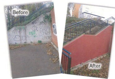
Youth Offending Service – examples of Reparation