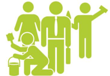
Reflecting the Five Ways of Working in all work