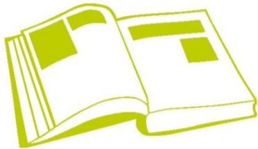
A new Corporate Plan

Embedding the Act in the various work of the Council has required new ways of working: