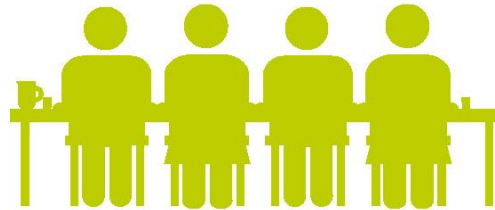
Outcome based Scrutiny